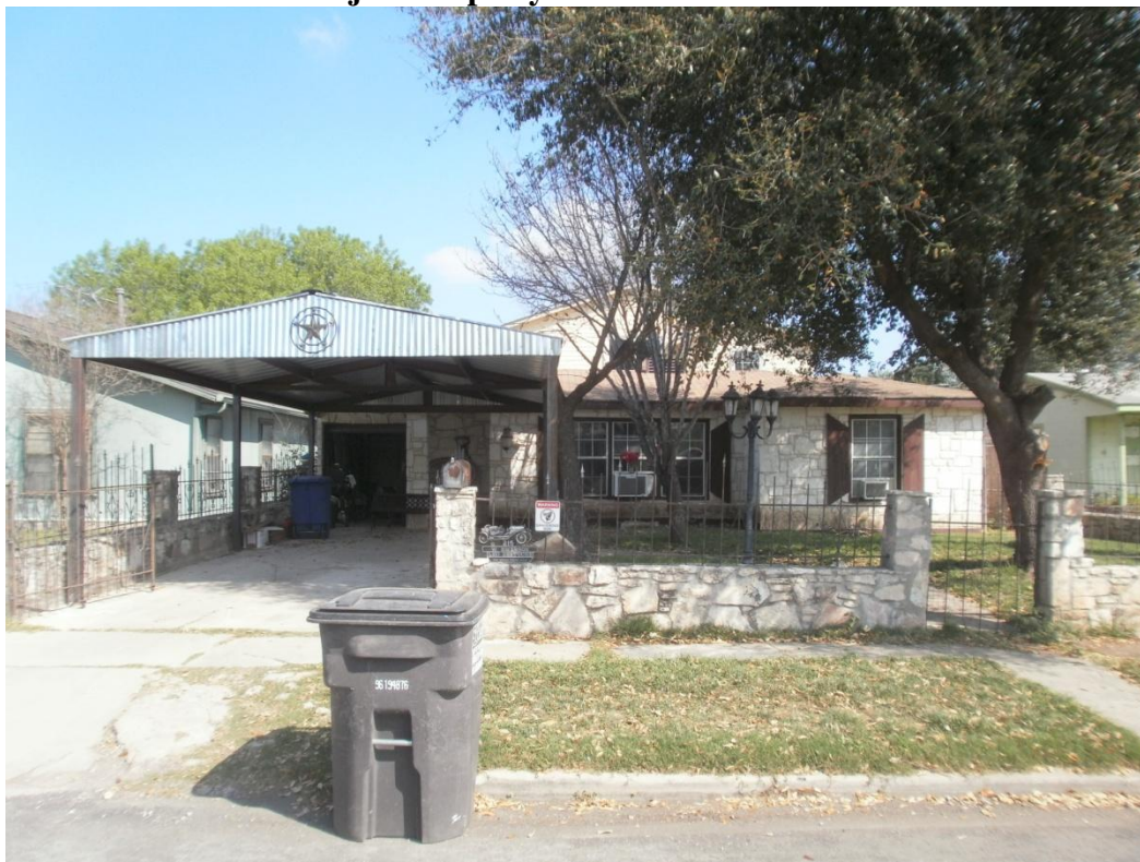
Carport encroaching into front and side setbacks