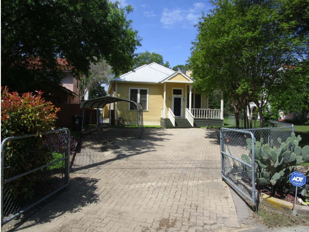
Location of proposed carport