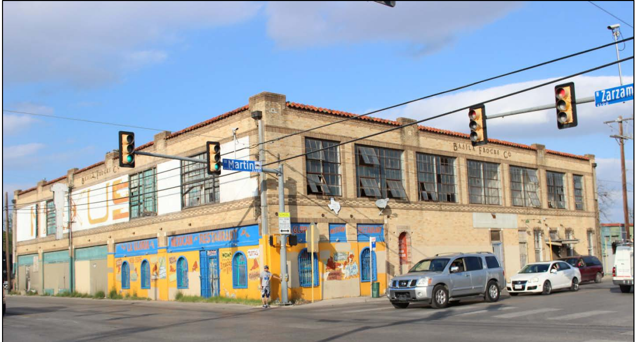
Western and southern façades from southwest corner of Martin and Zarzamora