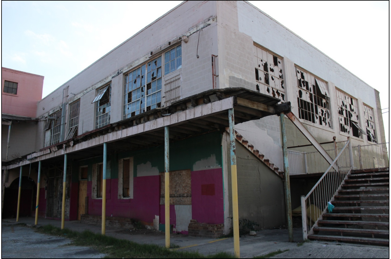
Rear of building