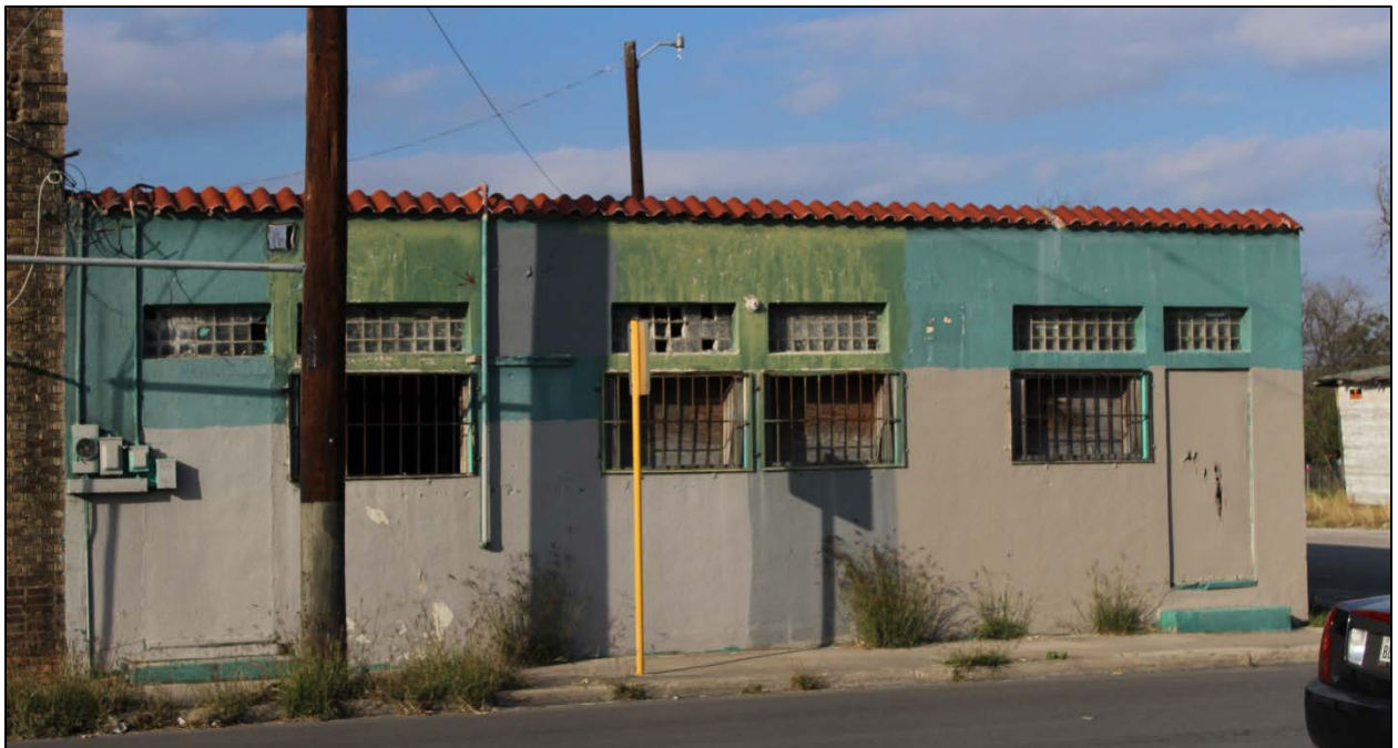
One story addition on eastern side, facing Martin