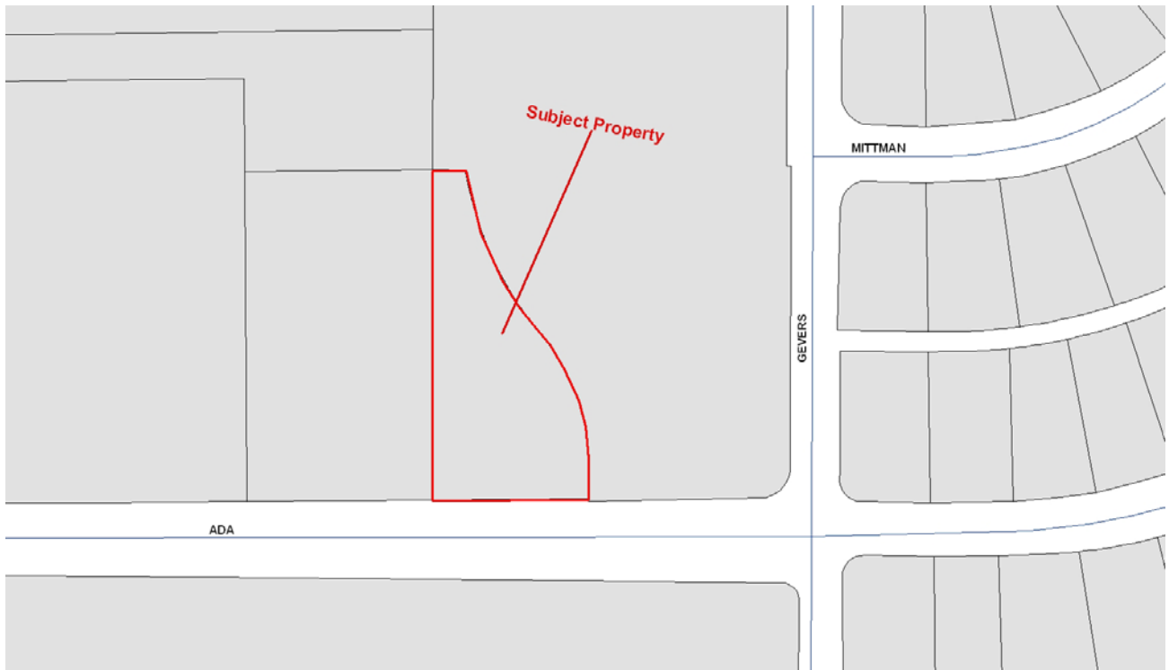
Map of Subject Property