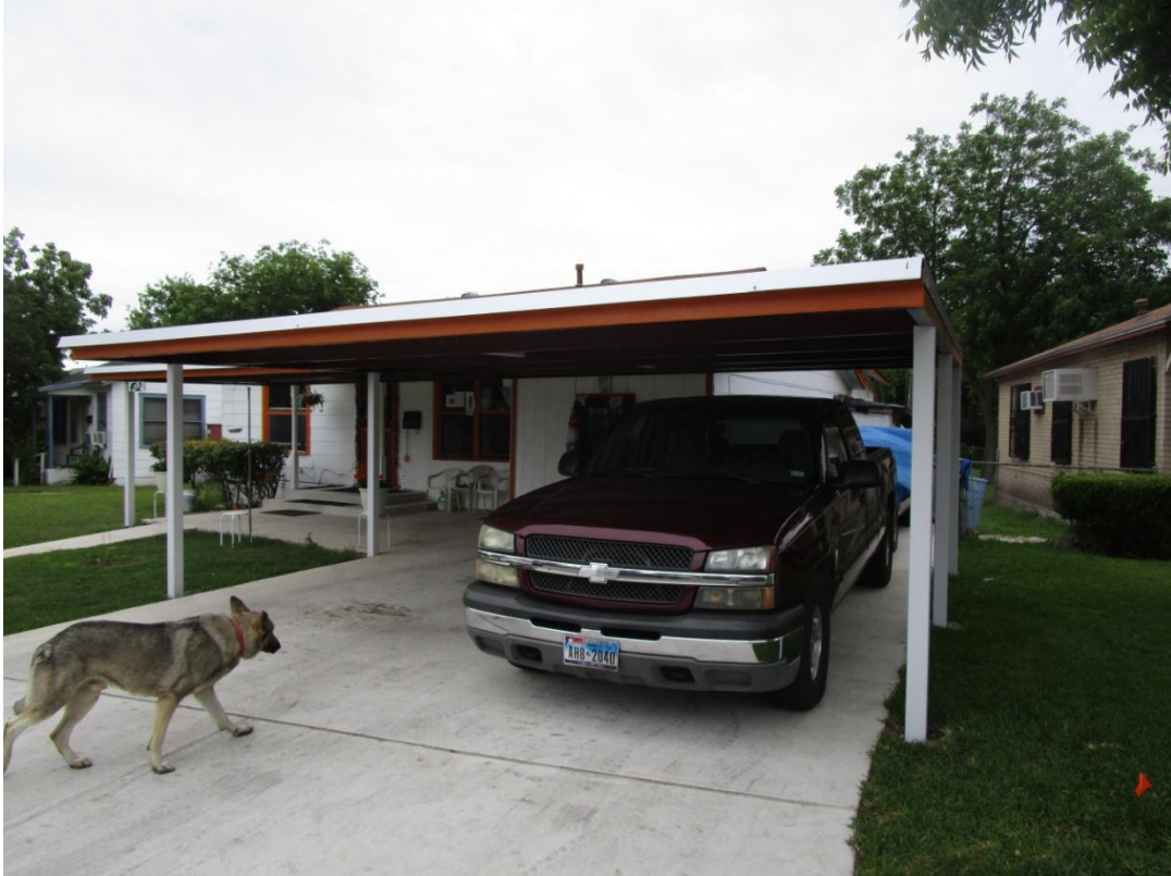
Carport as near as on the front property line