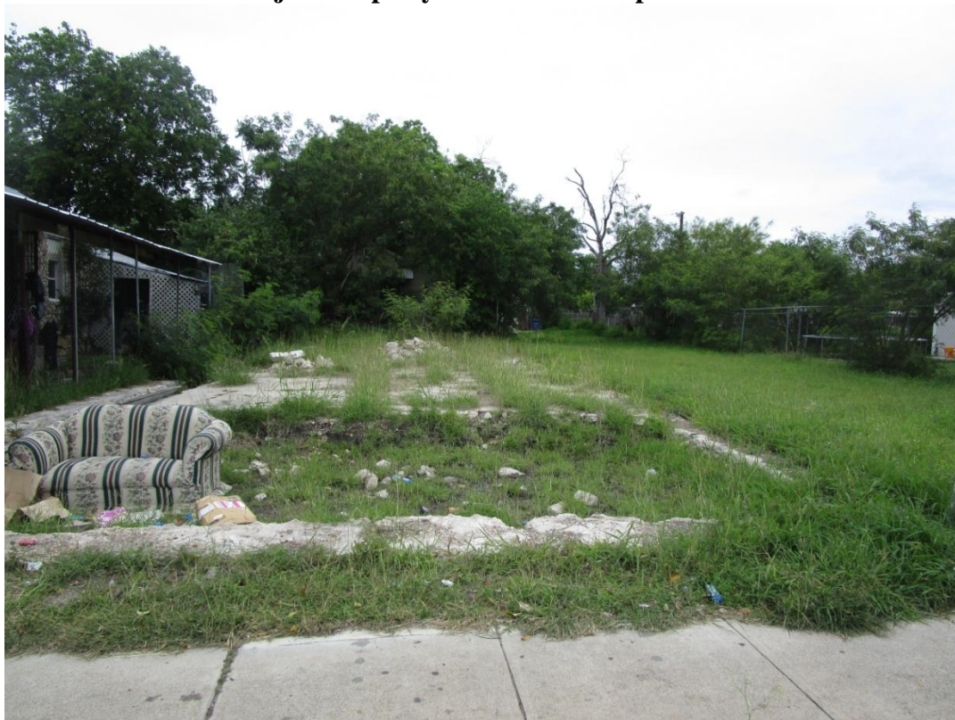
Property currently vacant