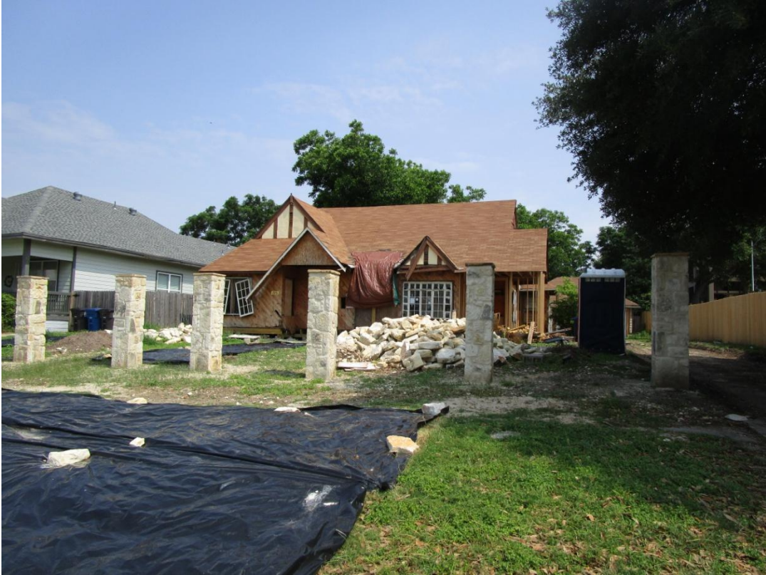
6' wood fencing, stone columns