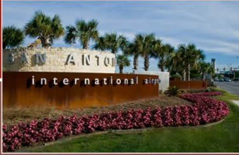
SAN ANTONIO INTERNATIONAL AIRPORT