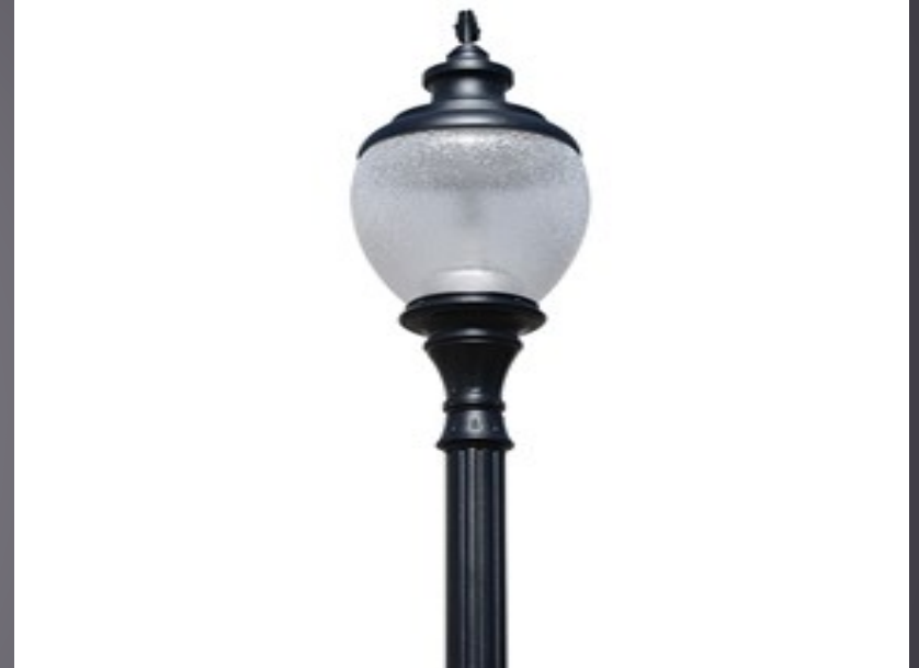
New Light Fixture