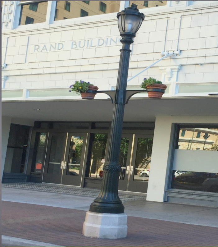
Existing Light Pole