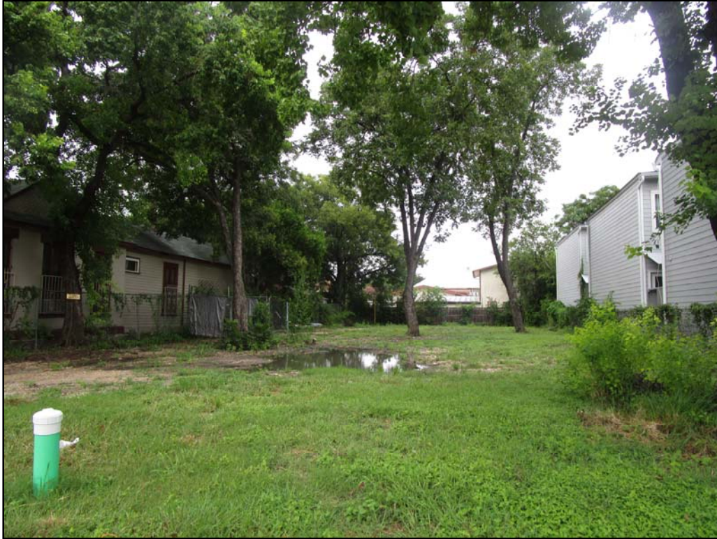
The subject property