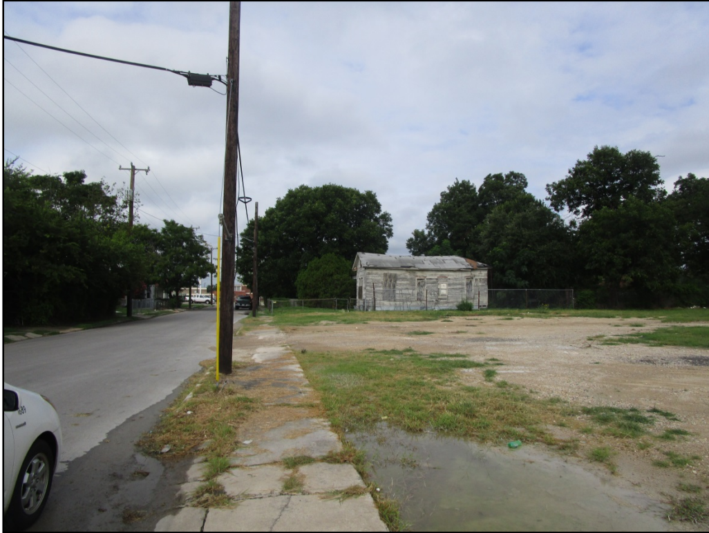
The subject property looking north