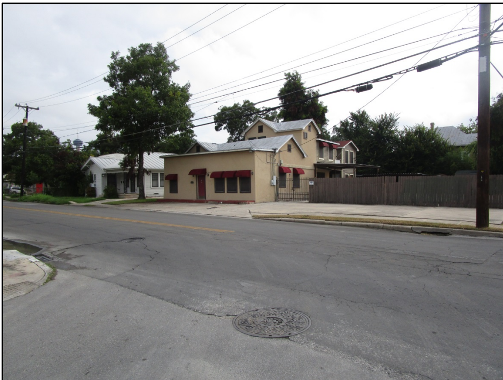
Across Locust Street down S. Presa Street