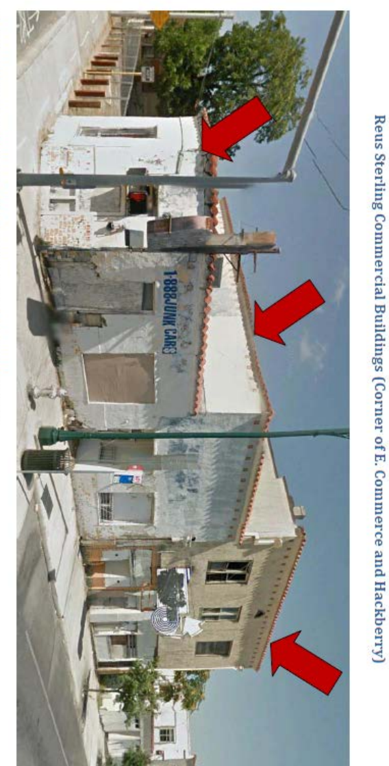
Three contiguous lots located at 1434 E. Commerce are on a single parcel.