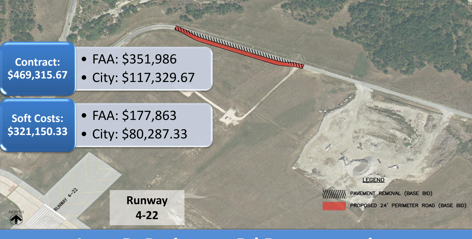
Item B: Perimeter Rd Reconstruction