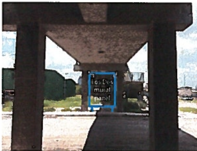
Location: "Los Dos" mural, Hays Street Bridge Underpass