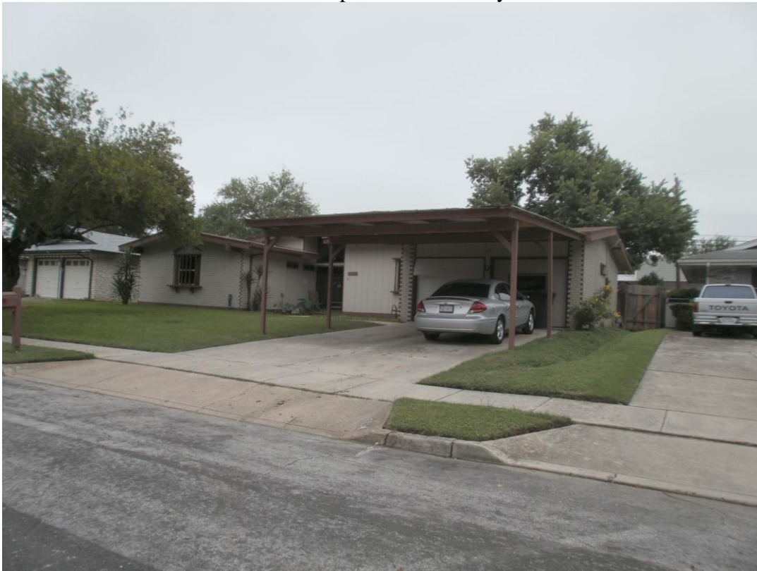
Other carport in community