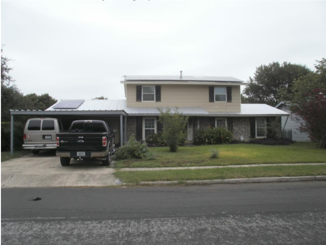
Carport meets side setback