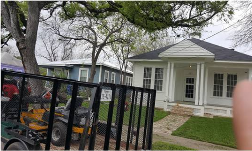
From SE of house

Elevations view Modules are not visible.