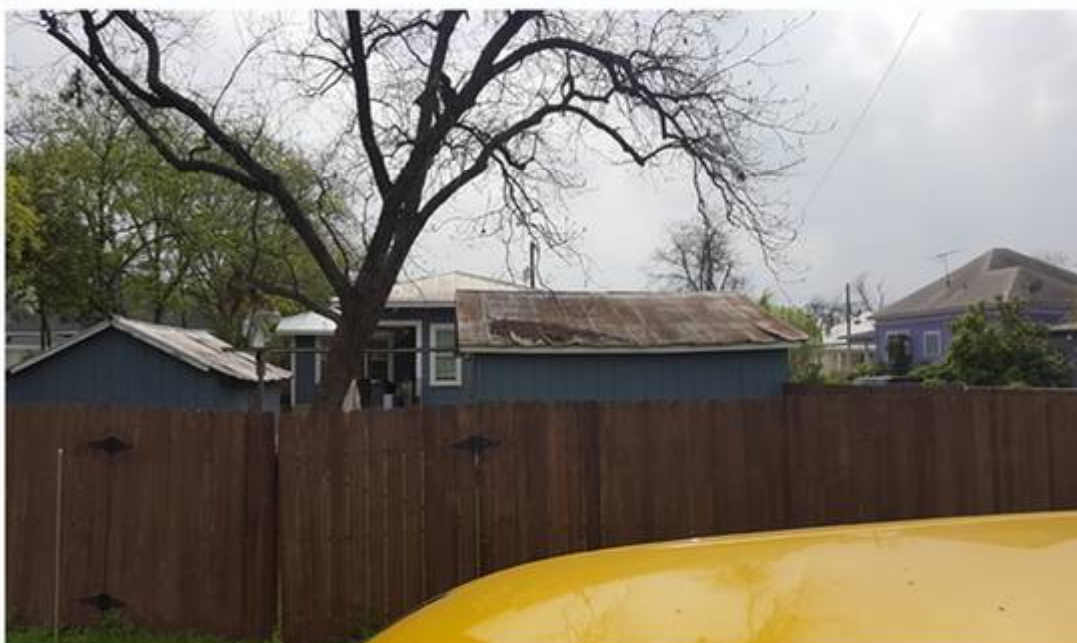
From rear of House