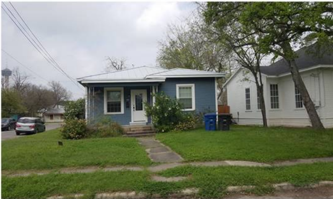
From Front of House