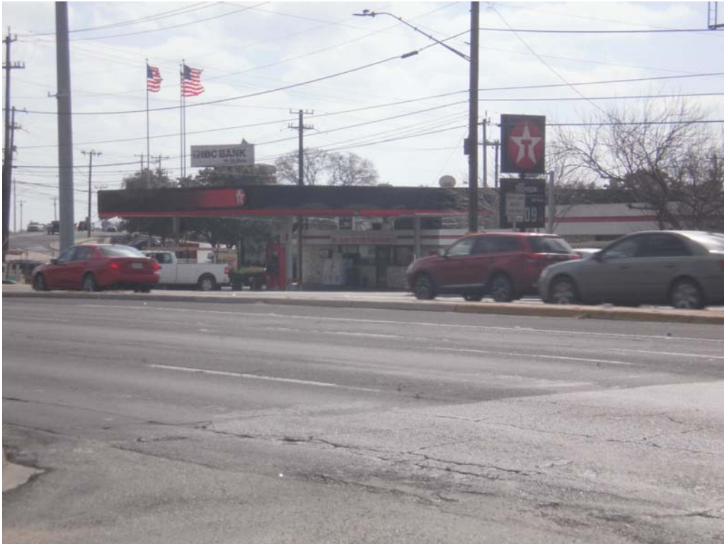
Curb Cut along Babcock before landscaping