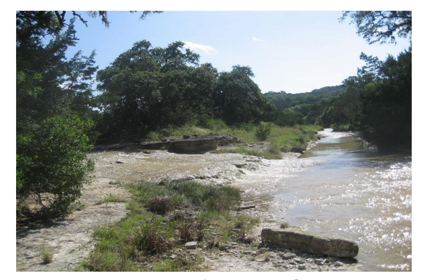
Middle Verde Creek