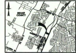
LOCATION MAP NOT-TO-SCALE