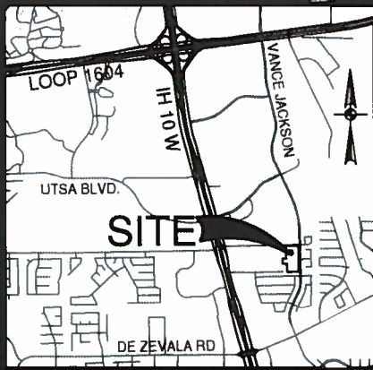
LOCATION MAP NOT-TO-SCALE

Current Zoning: "C-2 ERZD" Commercial Edwards Recharge Zone District Requested Zoning: "C-2 ERZD S" Commercial Edwards Recharge Zone District with a Specific Use Authorization for a Wireless Communication System Acres: 0.083