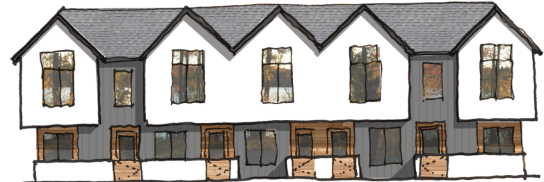
FRONT/STREET ELEVATION (C/D UNITS) 1607 BRACKENRIDGE 6.9.2017.