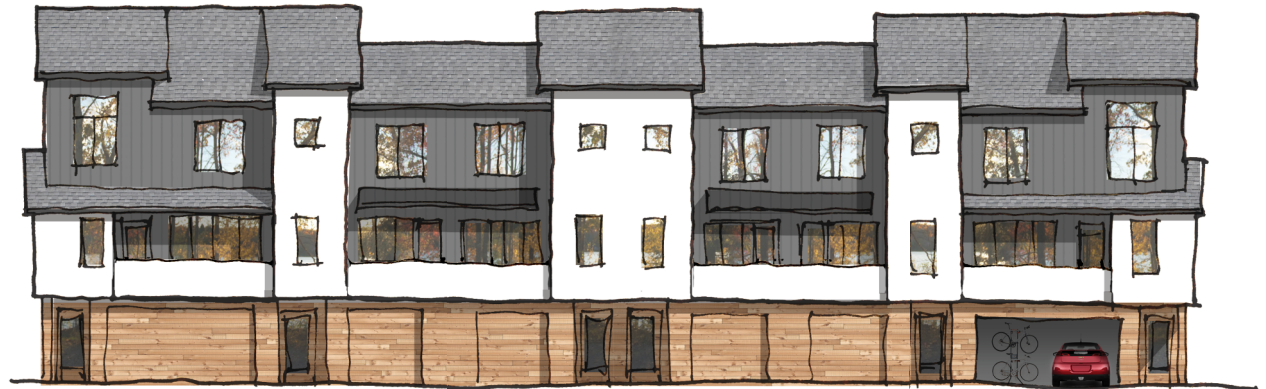
FRONT / STREET ELEVATION (A/B UNITS) 1607 BRACKENRIDGE G. 9. 2017