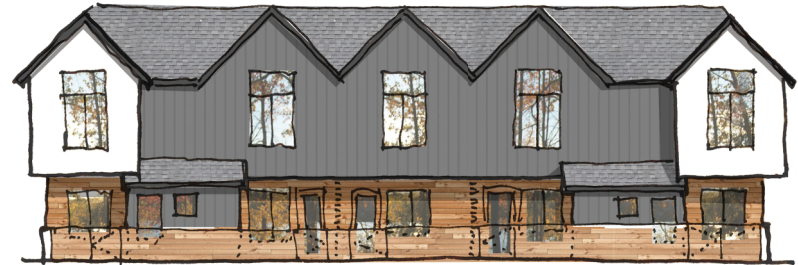
REAR/COURTYARD ELEVATION (C/D UNITS)