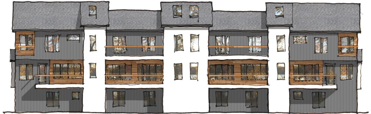
REAR / FT. SAM ELEVATION (A/B UNITS)