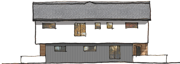
SIDE/STREET ELEVATION (C/D UNITS)