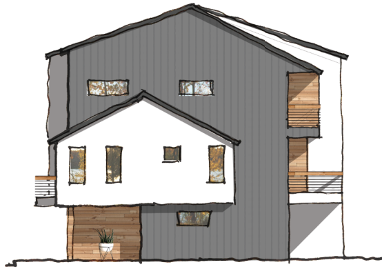
SIDE / END ELEVATION (A/B UNITS)