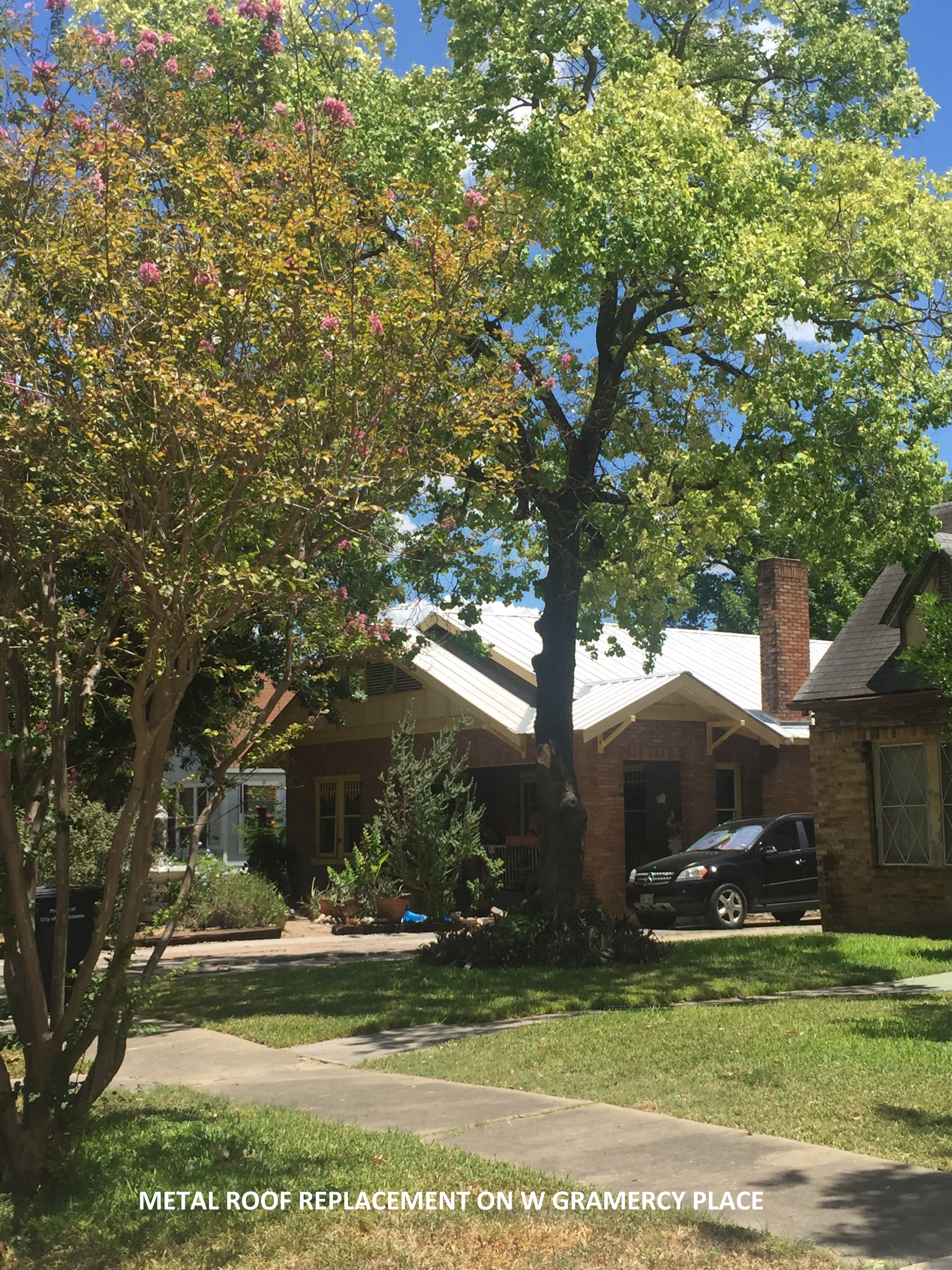
METAL ROOF REPLACEMENT ON W GRAMERCY PLACE