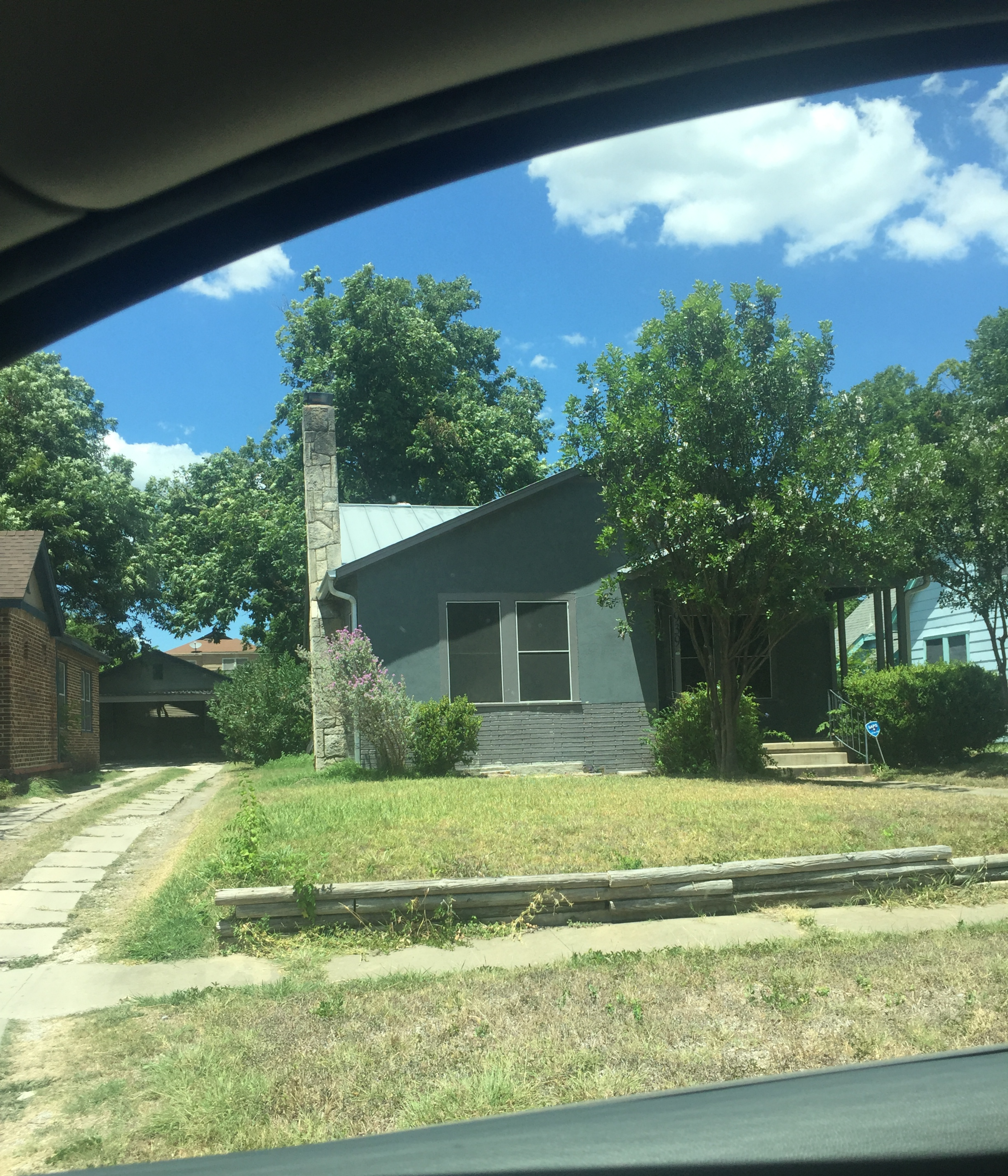
METAL ROOF REPLACEMENT ON W GRAMERCY PLACE