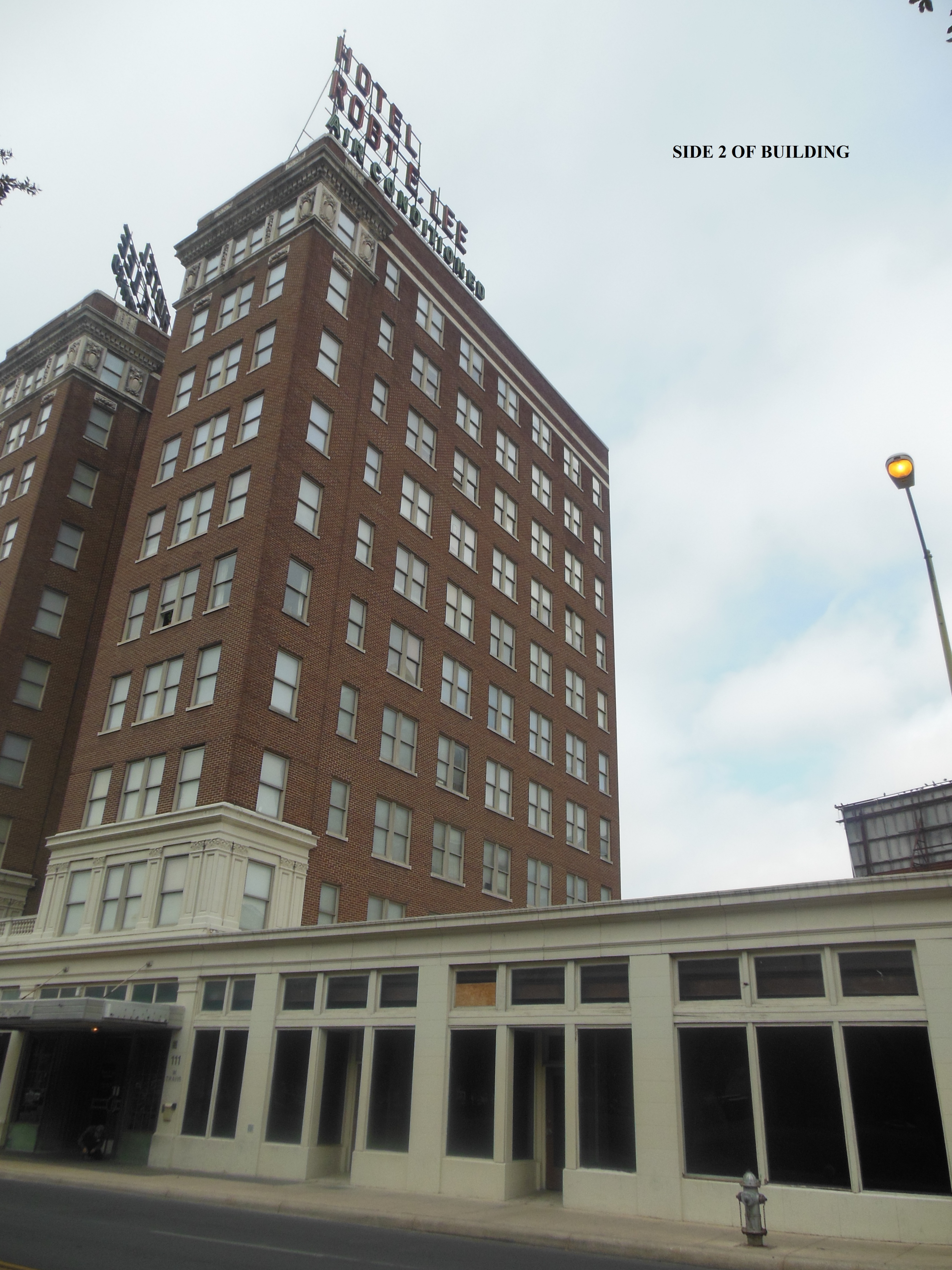
SIDE 2 OF BUILDING