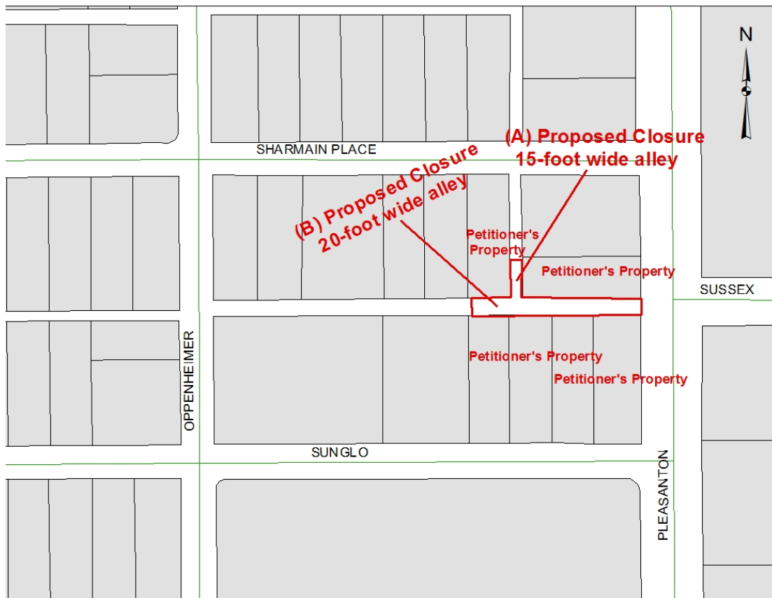
Map of Proposed Closures