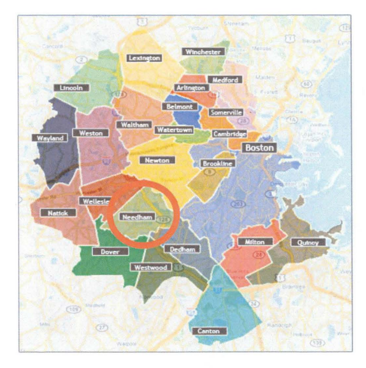
- 0.5% - 17.7% - 20.1% - 48.1% - Metro West --- Needham