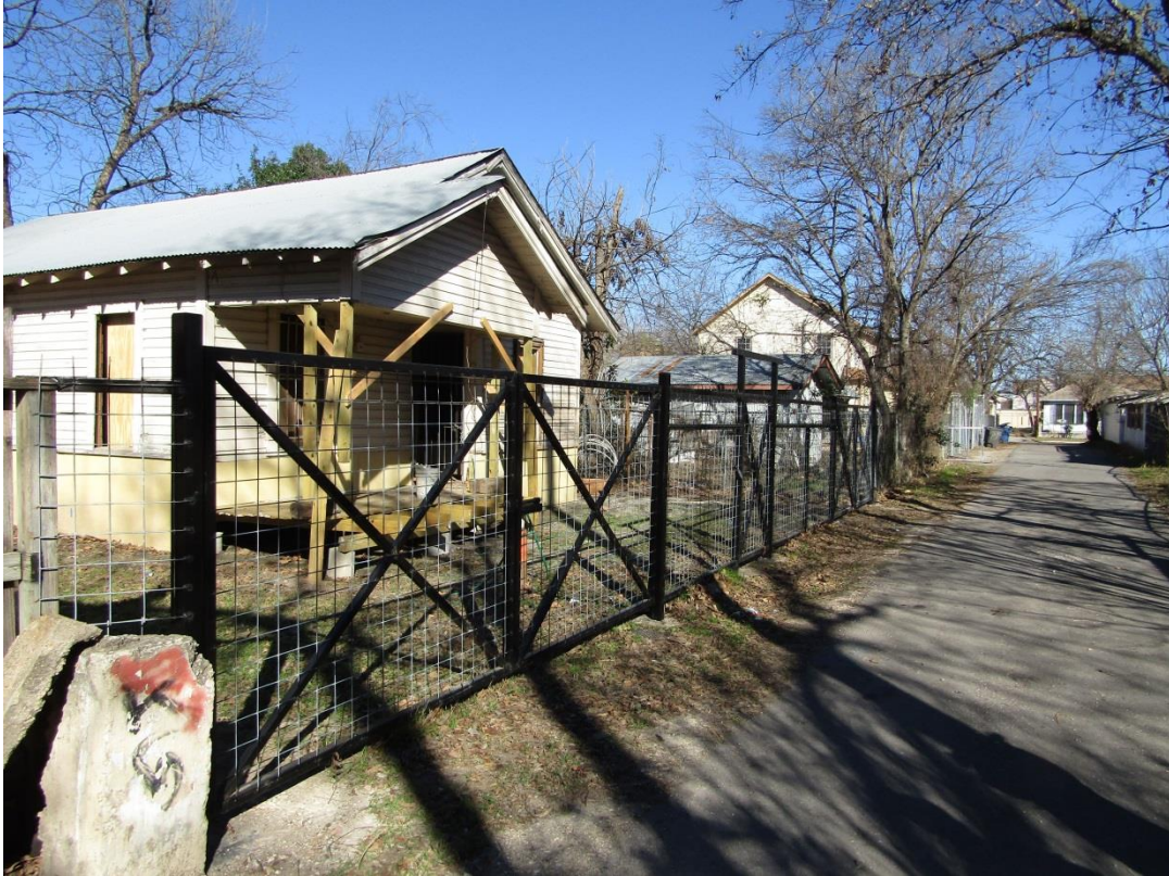
Subject Property – (Street view to the North)