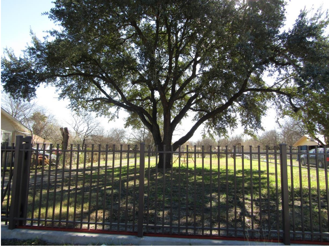
Subject Property – (Street view to the East)