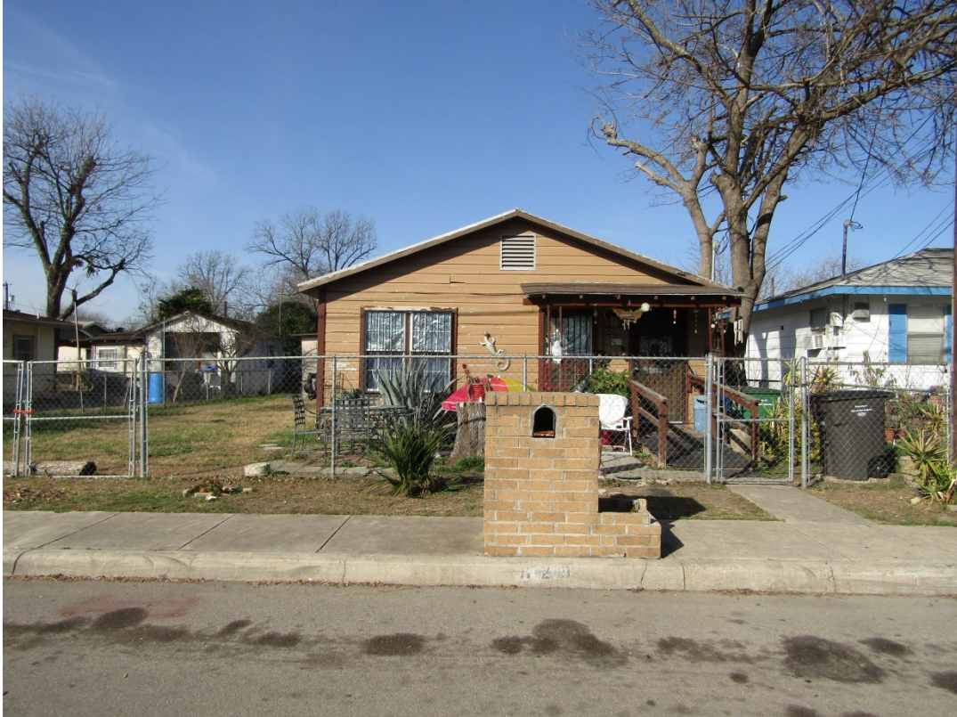
Subject Property side view