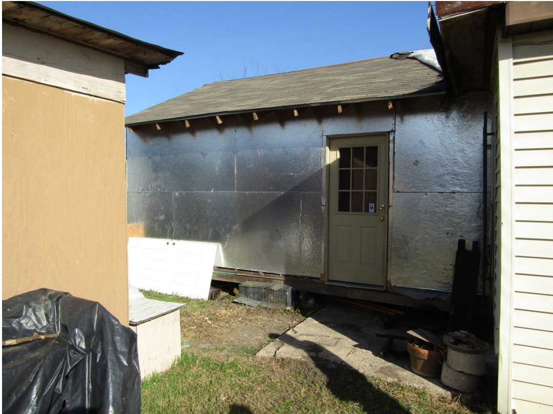
View of the rear side setback meat