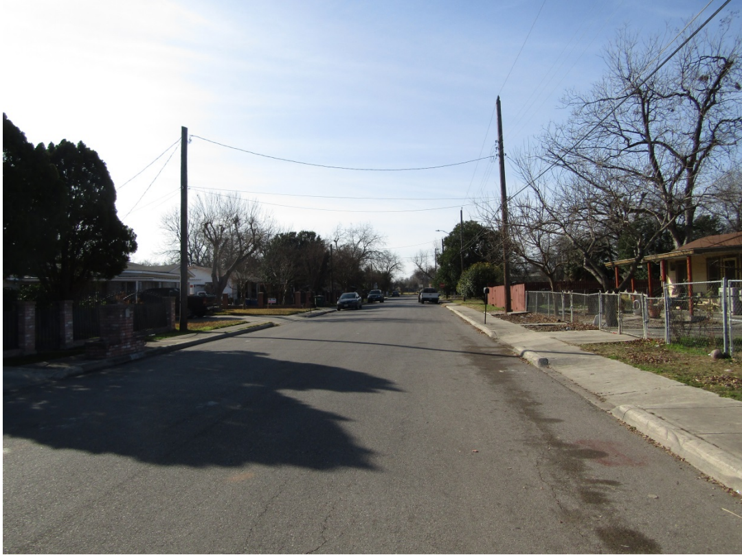
Streetscape view to the North