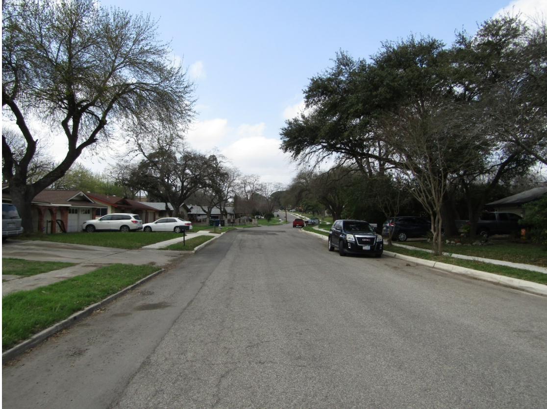
Streetscape along Bennington Drive