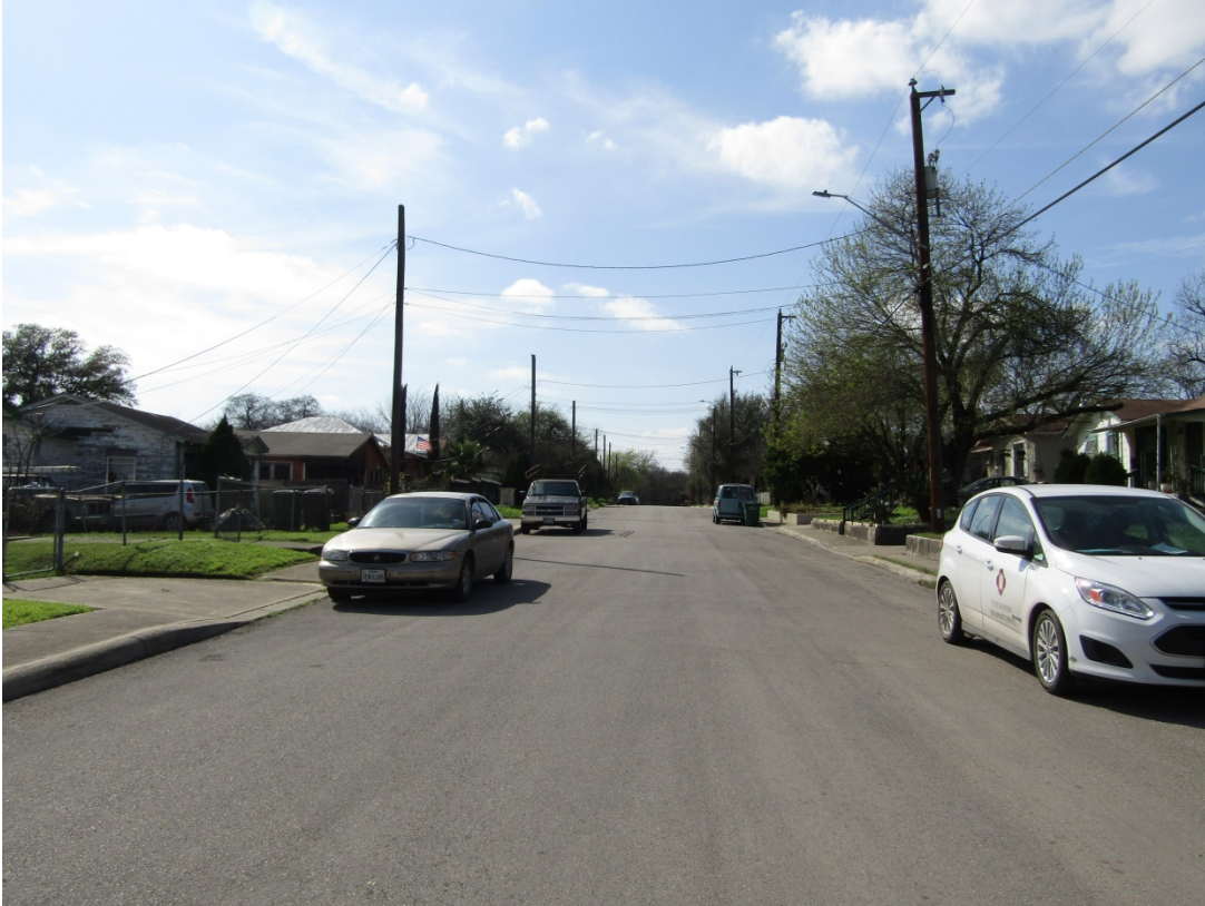
Streetscape along North Grimes/Center Street North