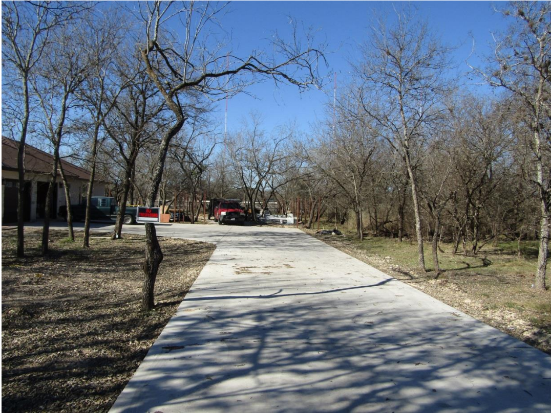
Location of eight foot tall fence