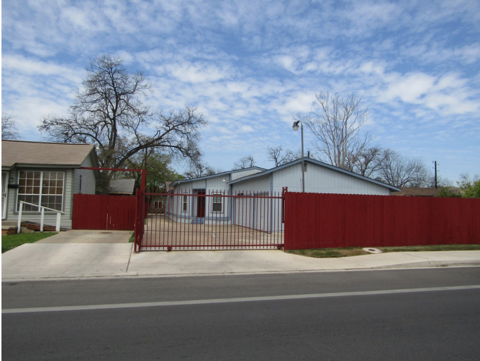
Streetscape along W. Malone Ave (Looking West)

Subject Property – 806 West Theo (From the Rear Along West Malone Ave.)