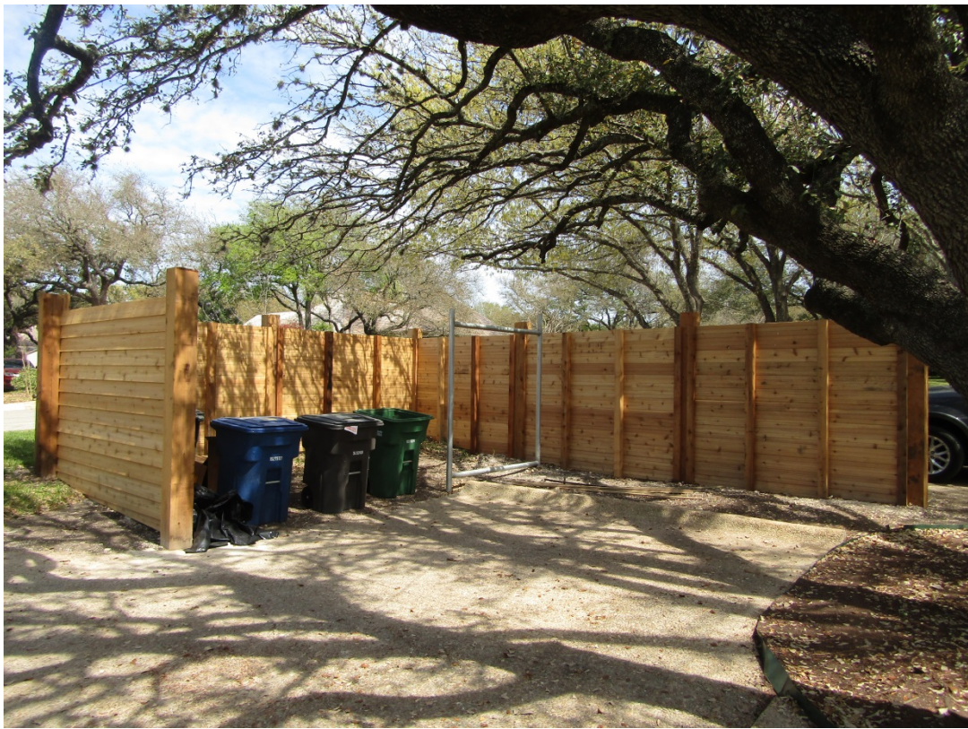
Tallest height 8' 2" front yard fence