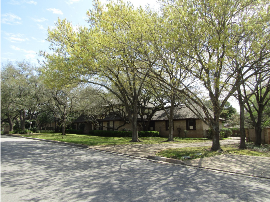
Neighboring property across the street