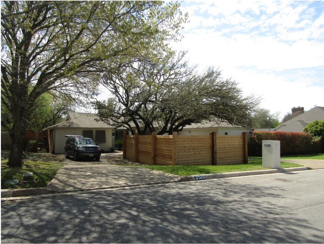
Subject Property front yard fence