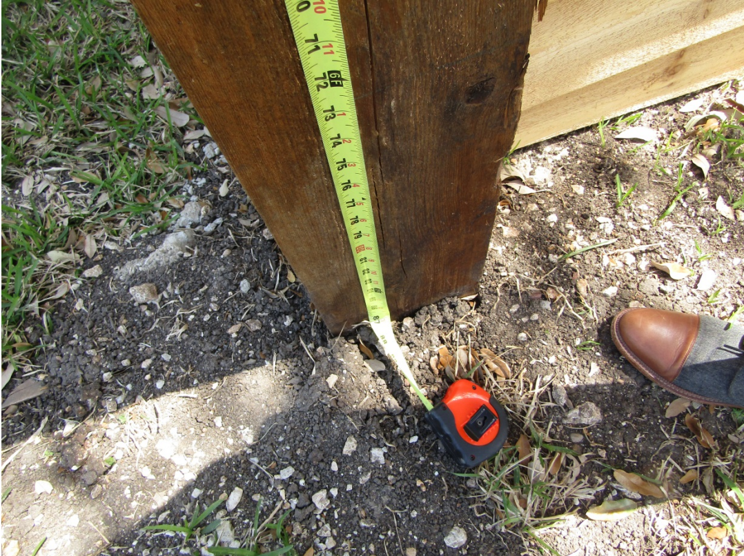
View of the privacy fence