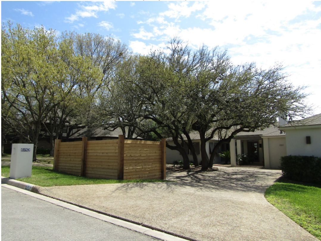
View from the inside of the front yard fence