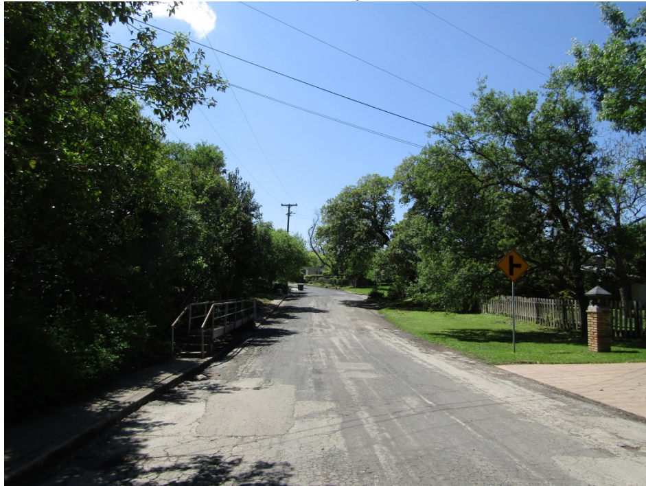
Side Property View