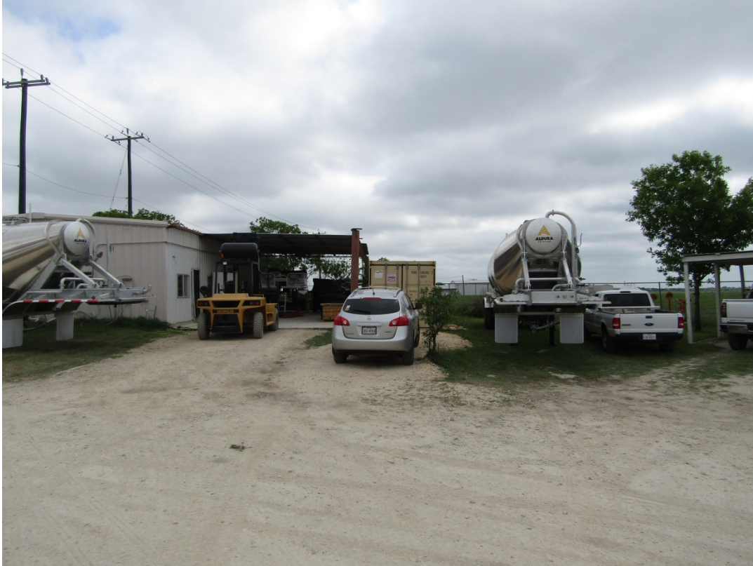
West view along subject property

Subject Property – 11460 IH-10 East and 11402 IH-10 East