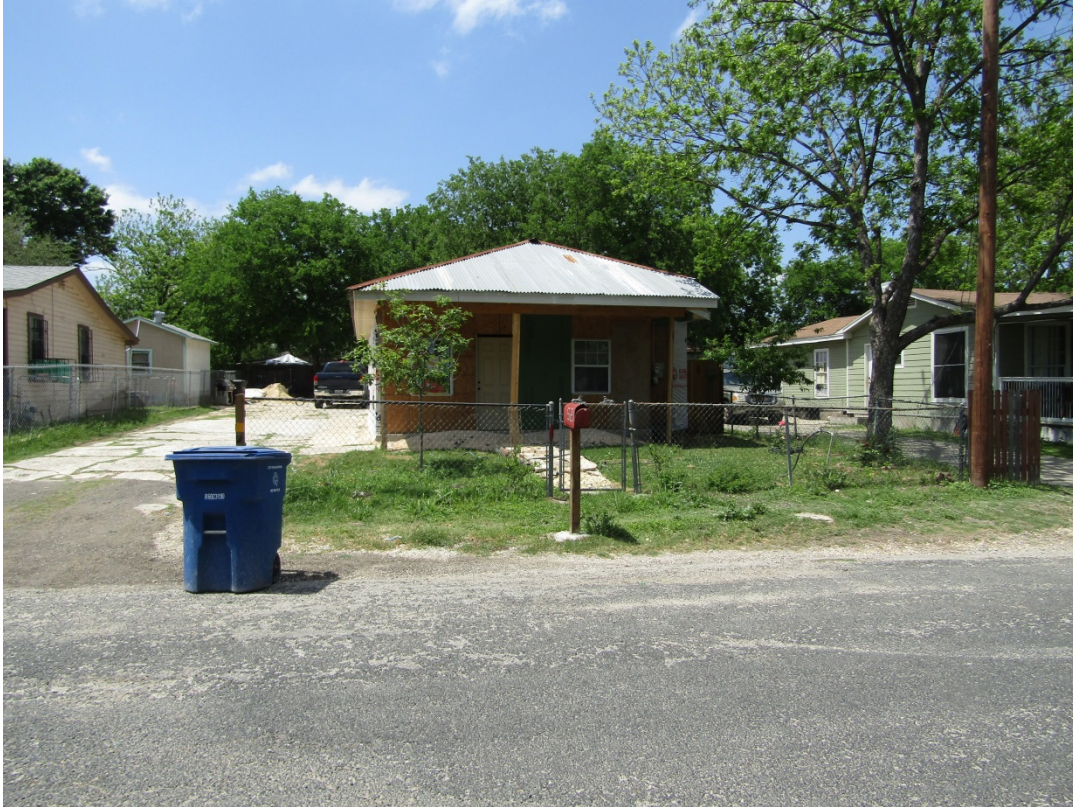
North View of subject property