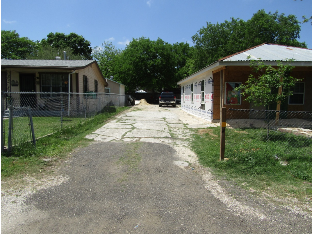
Streetscape of North San Dario Street to the South