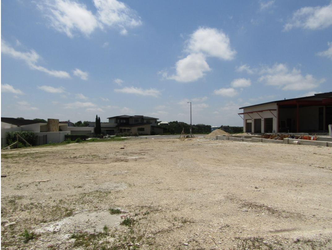
Subject Property – 7010 Bella Rose