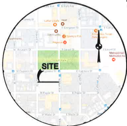
VICINITY MAP NOT TO SCALE SAN ANTONIO, TEXAS