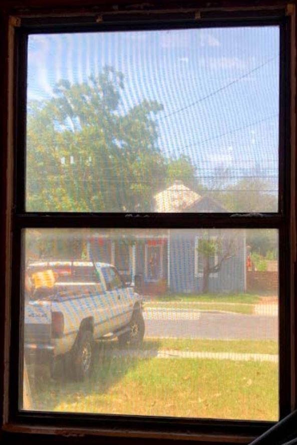
STAFF PHOTO MAY 29, 2018