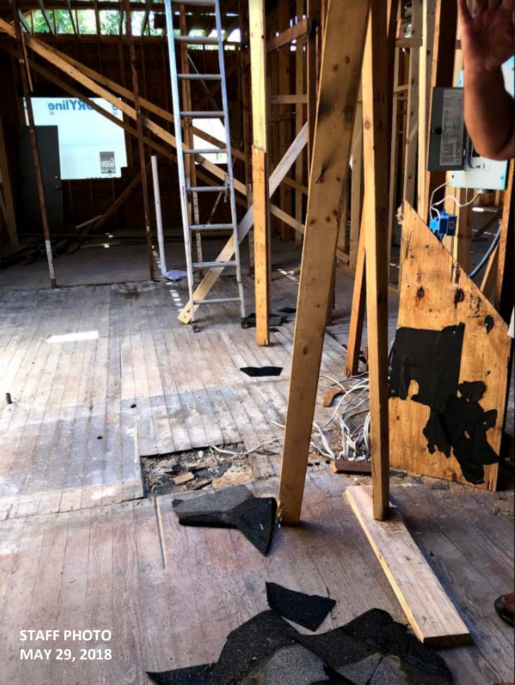
STAFF PHOTO MAY 29, 2018