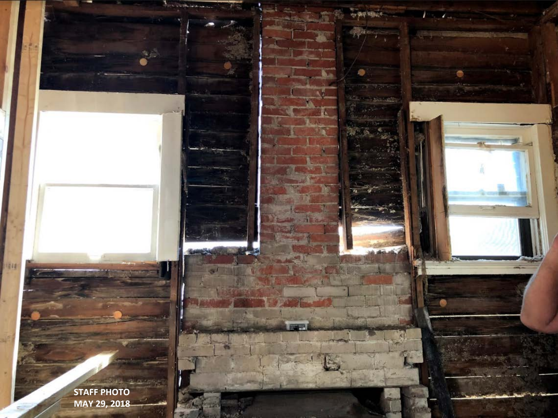
STAFF PHOTO MAY 29, 2018