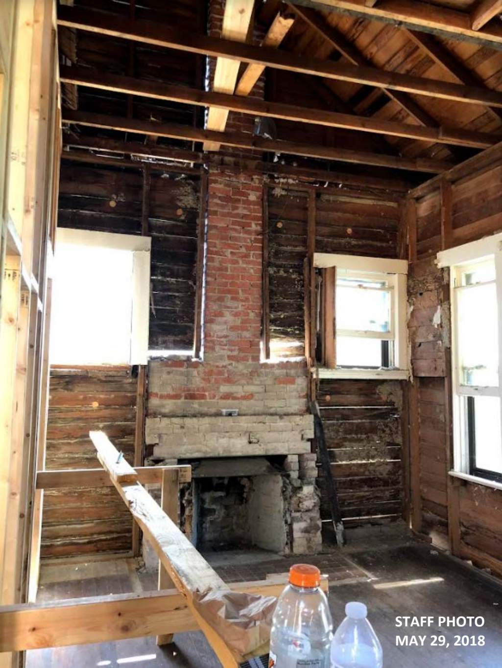
MAY 29, 2018