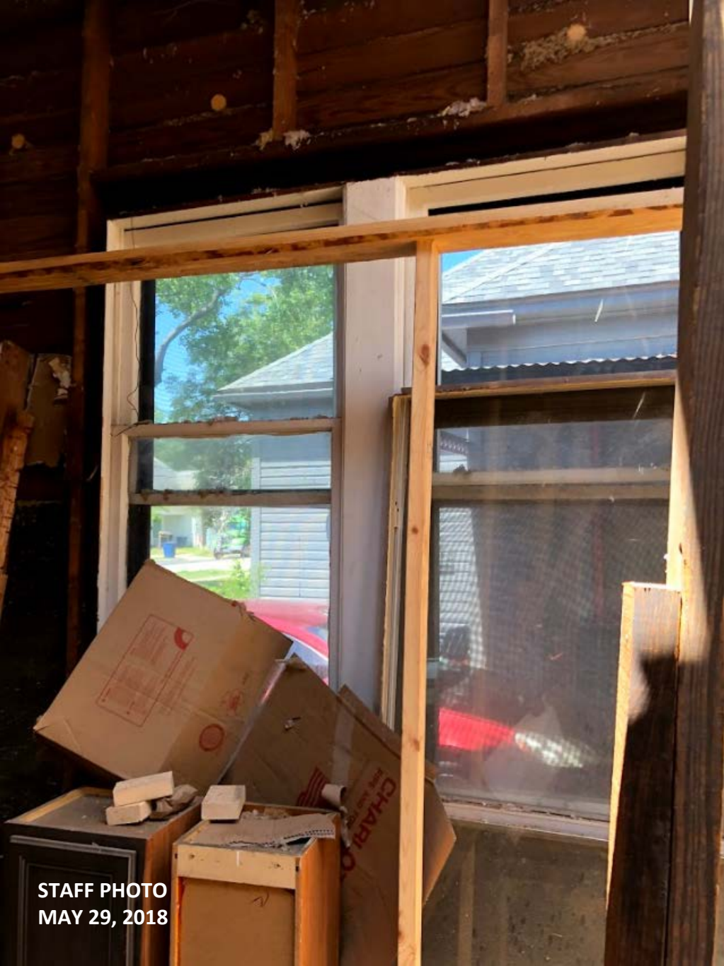
MAY 29, 2018