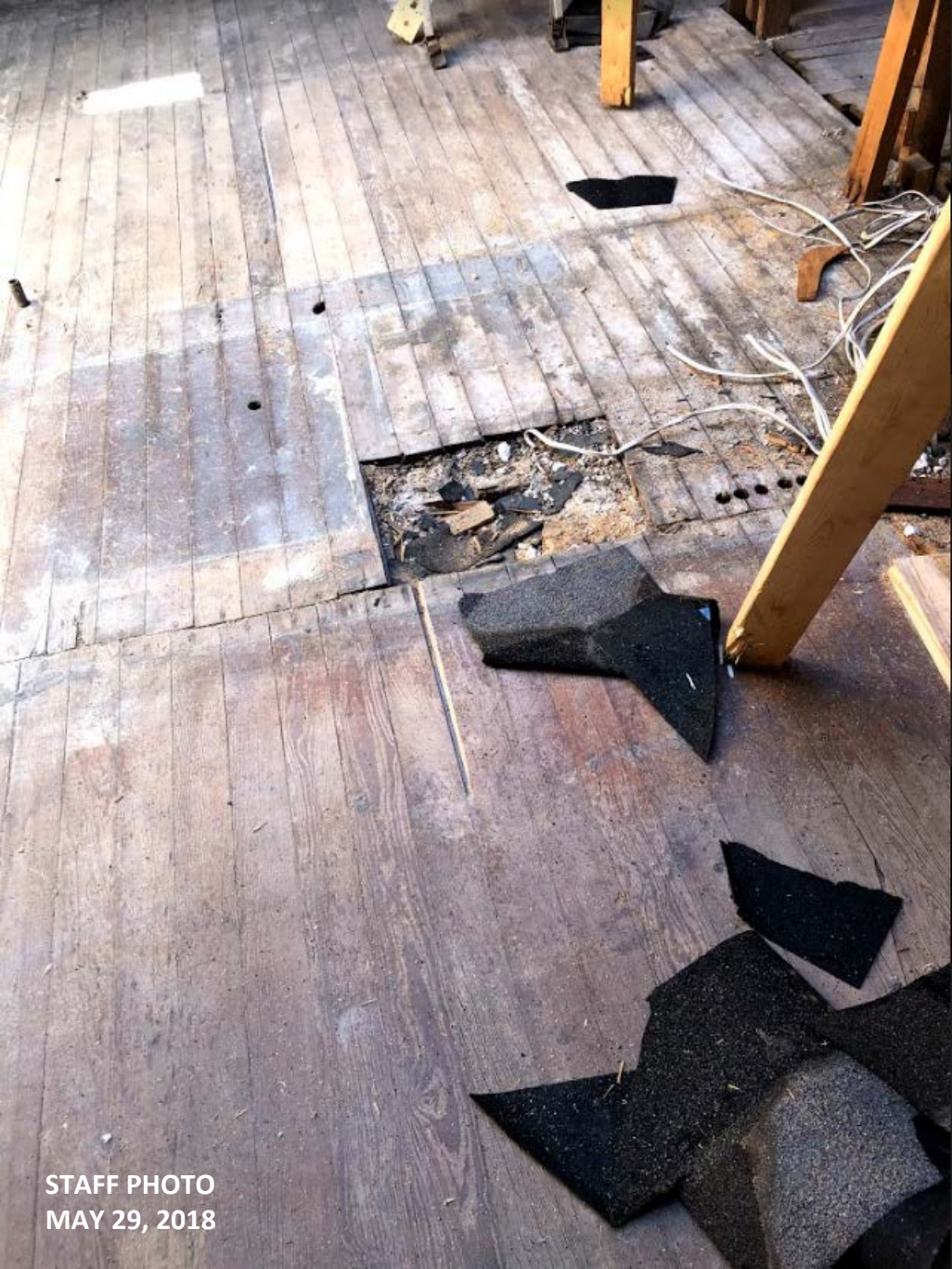
STAFF PHOTO MAY 29, 2018