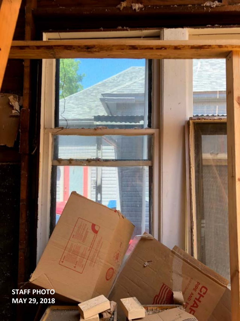
STAFF PHOTO MAY 29, 2018