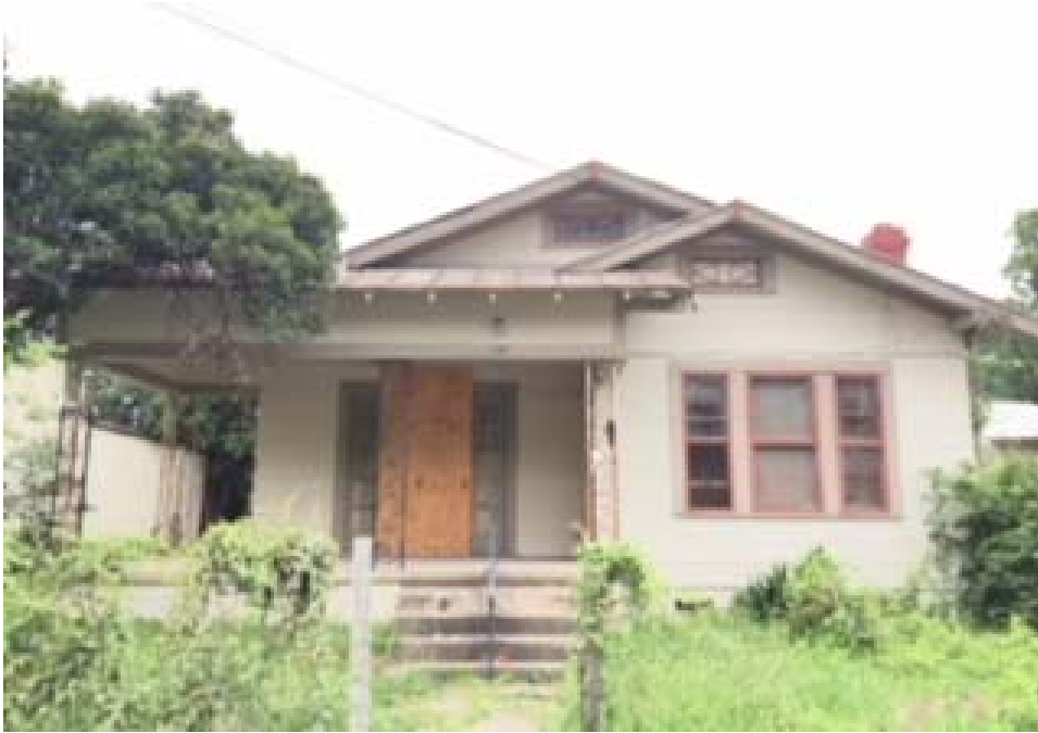
904 E Euclid