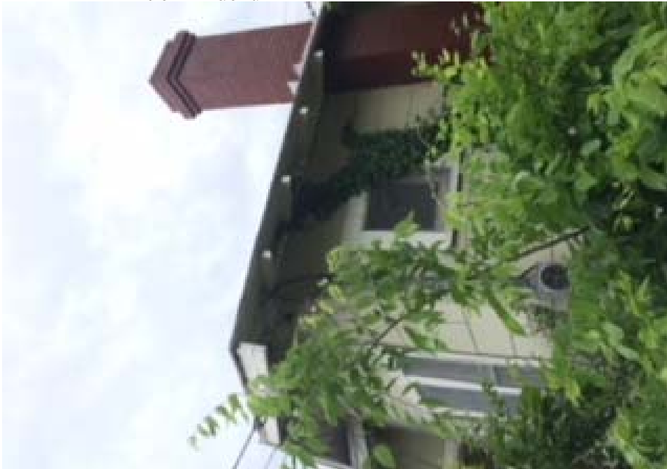
904 E Euclid