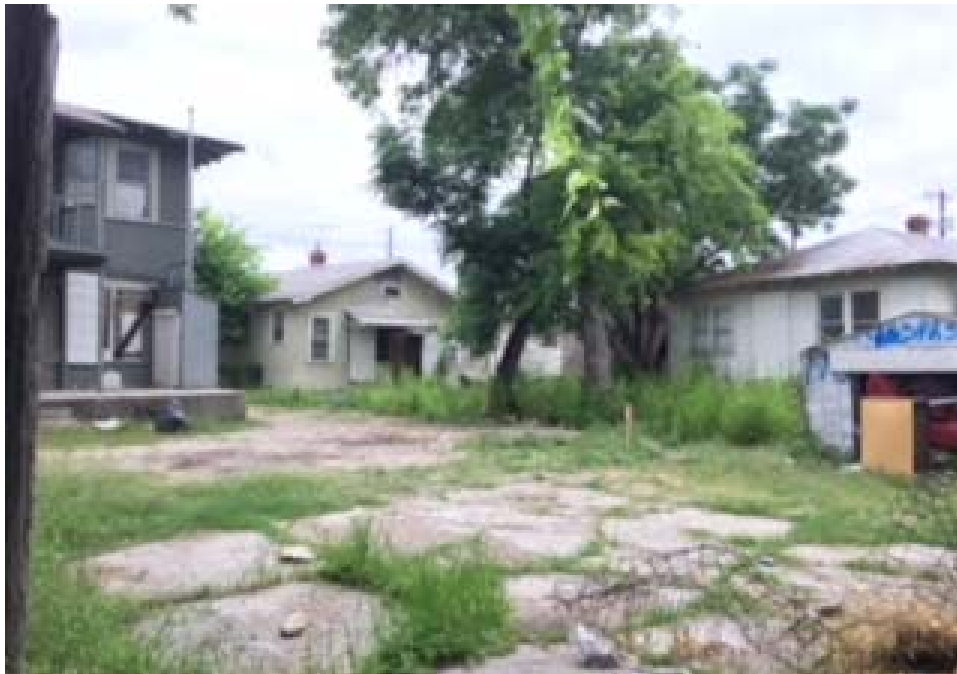
Rear of all 3