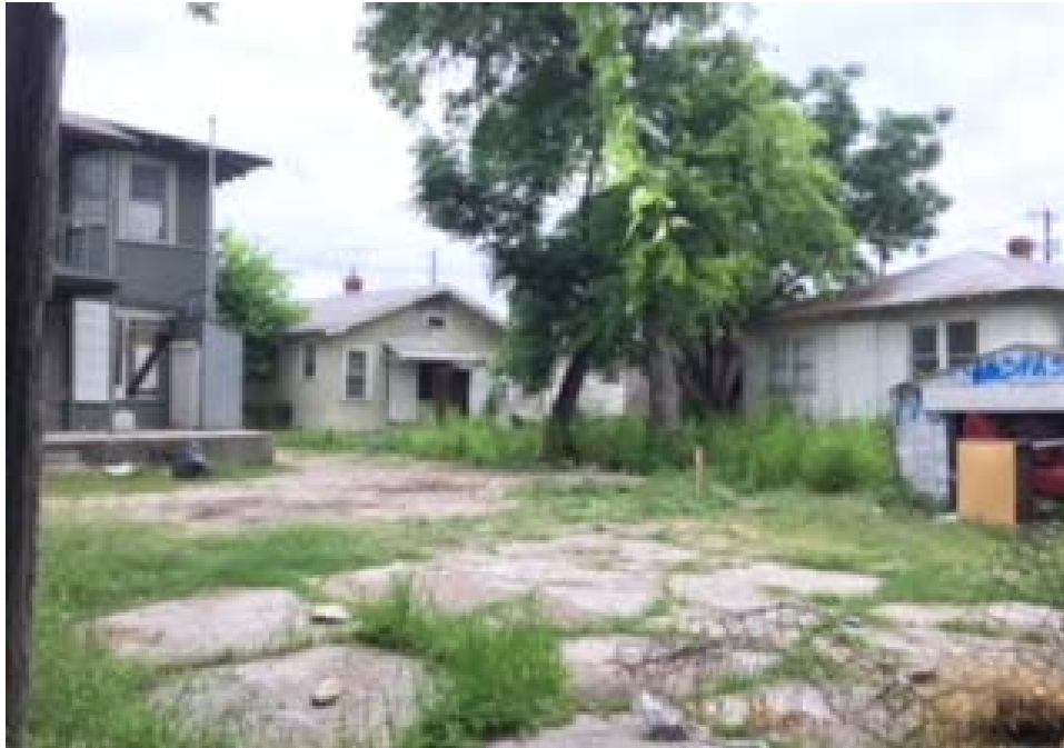
Rear of all 3