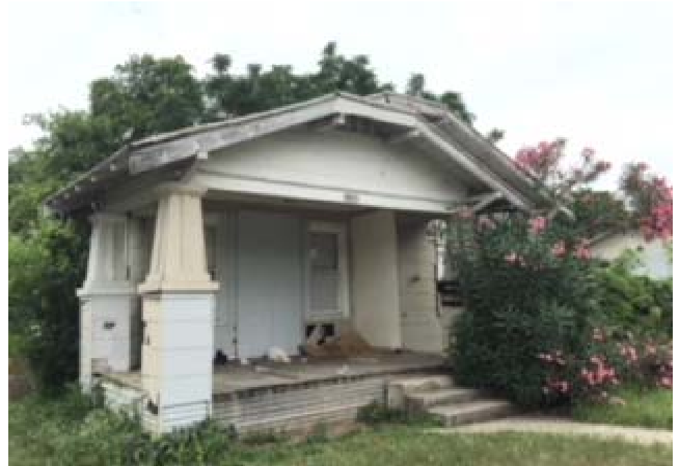
1817 N St Mary's