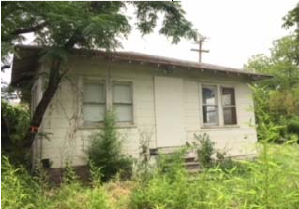
Rear of 1817 N St mary's