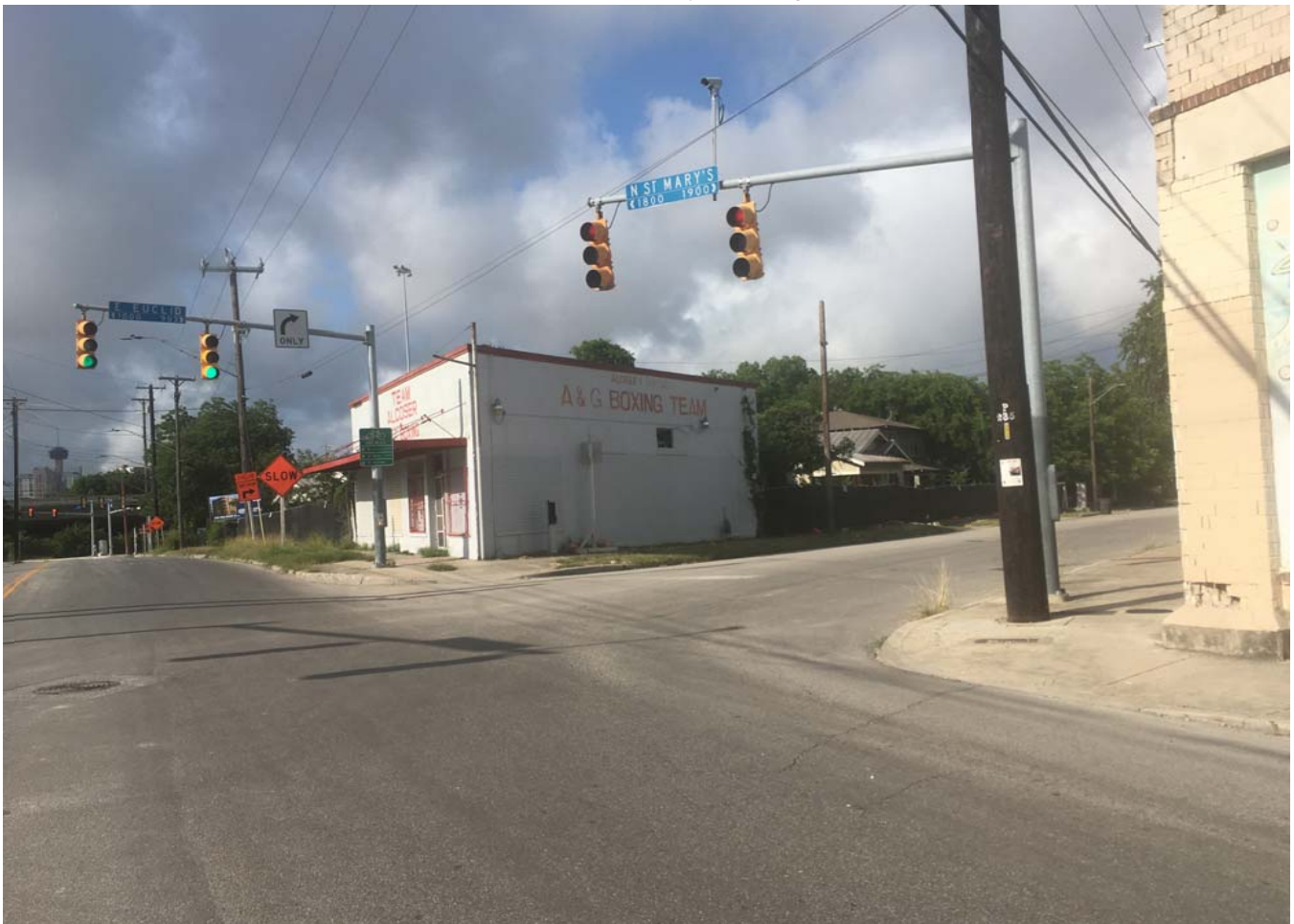
Side of 1827 N St Mary's, facing Euclid