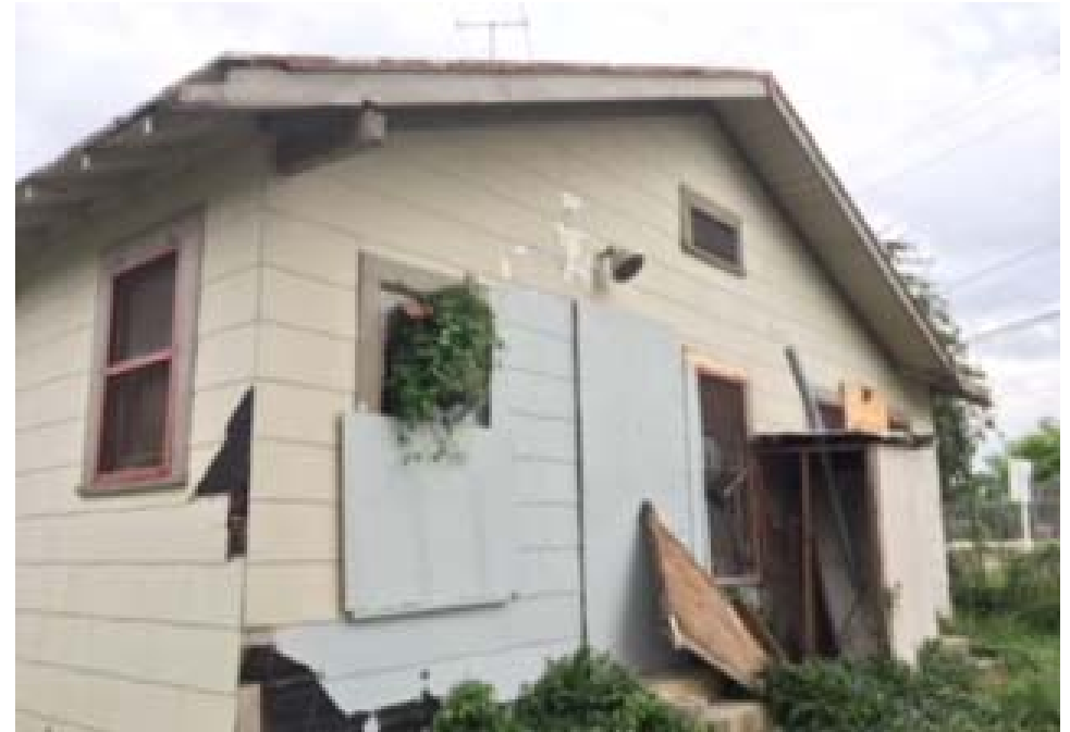
Rear of 904 E Euclid