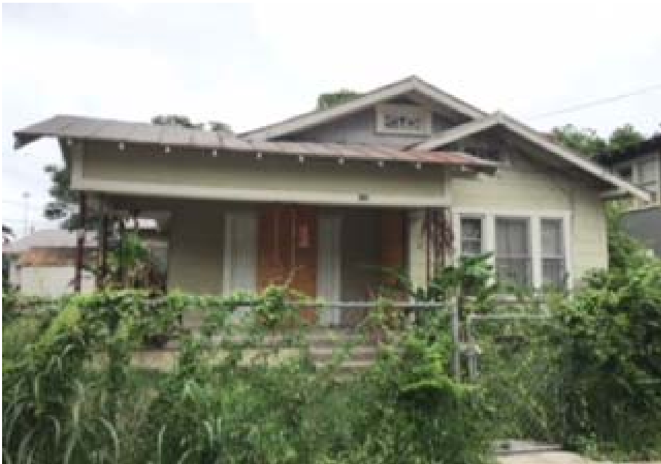
902 E Euclid