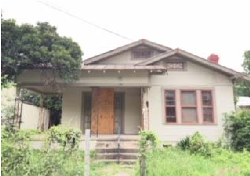
904 E Euclid