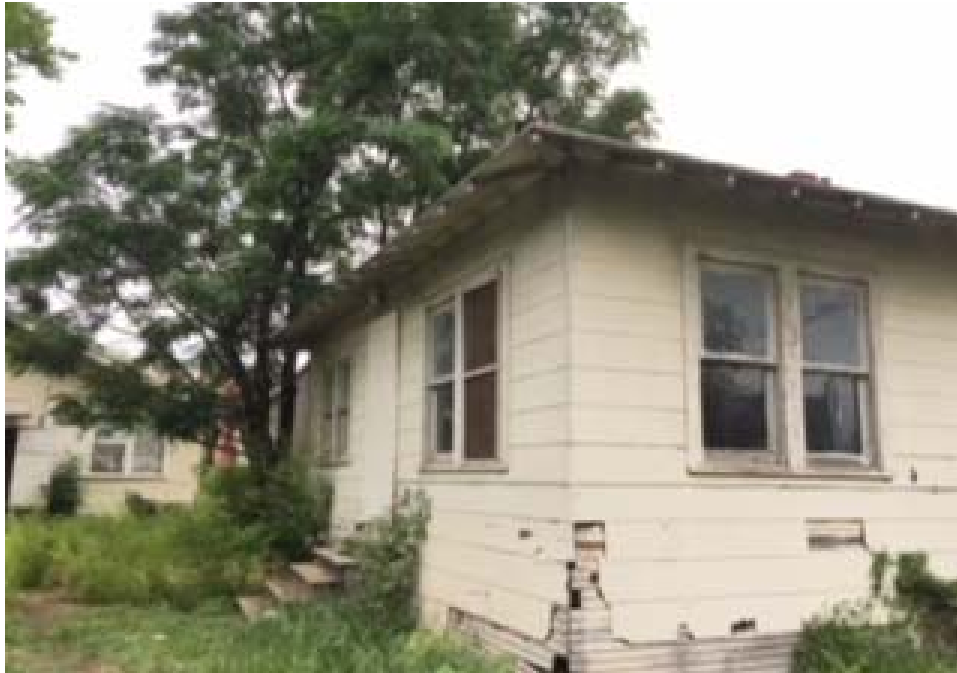
Left of 1817 N St Mary's