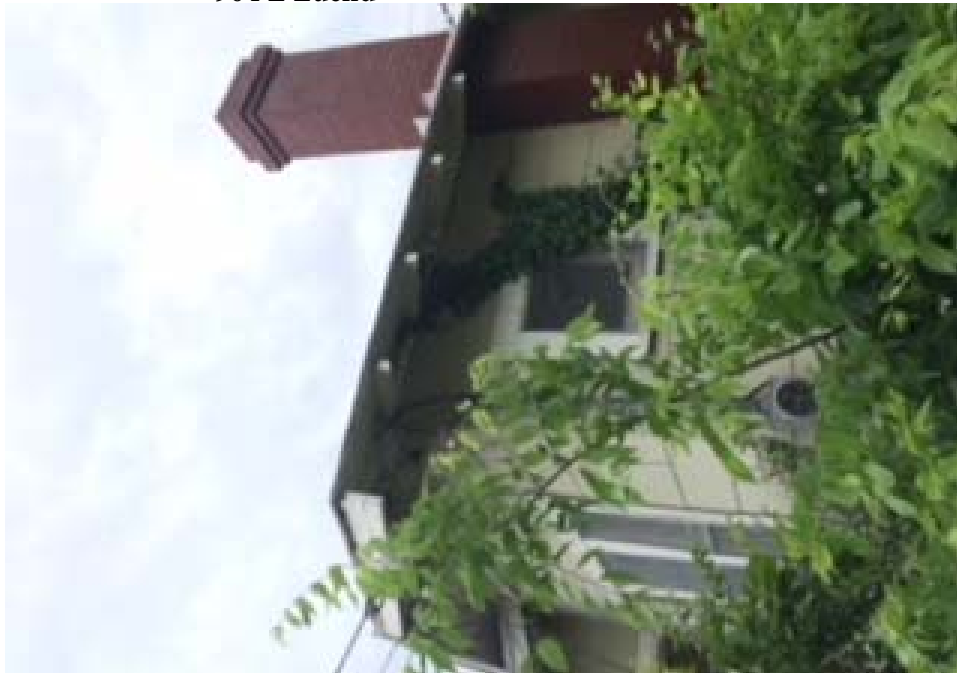
904 E Euclid