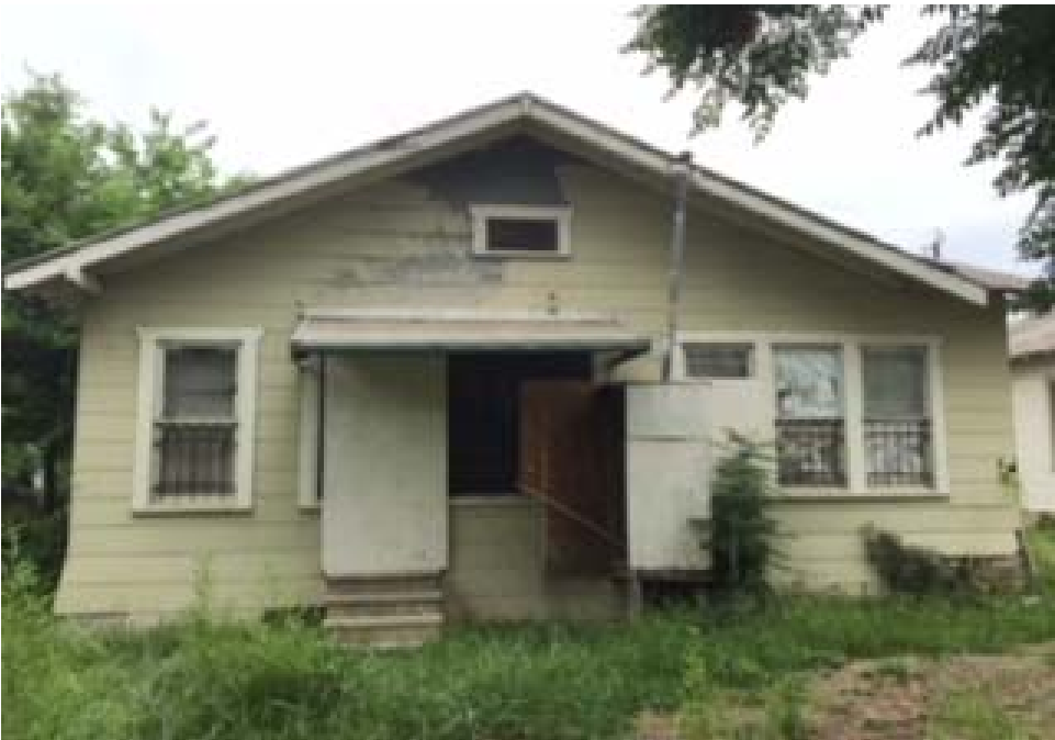
Rear of 902 E Euclid