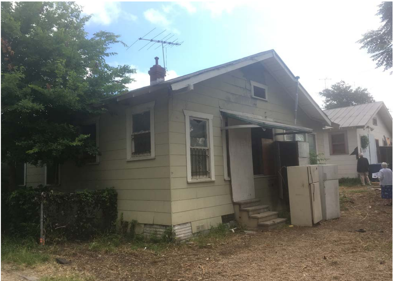
902 E Euclid