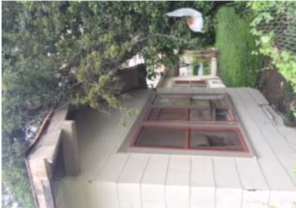
Left, rear of 904 E euclid