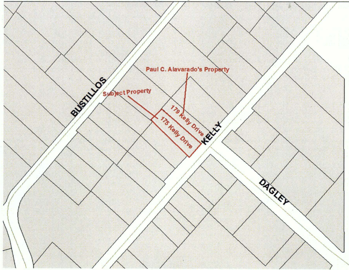
Map of Subject Property