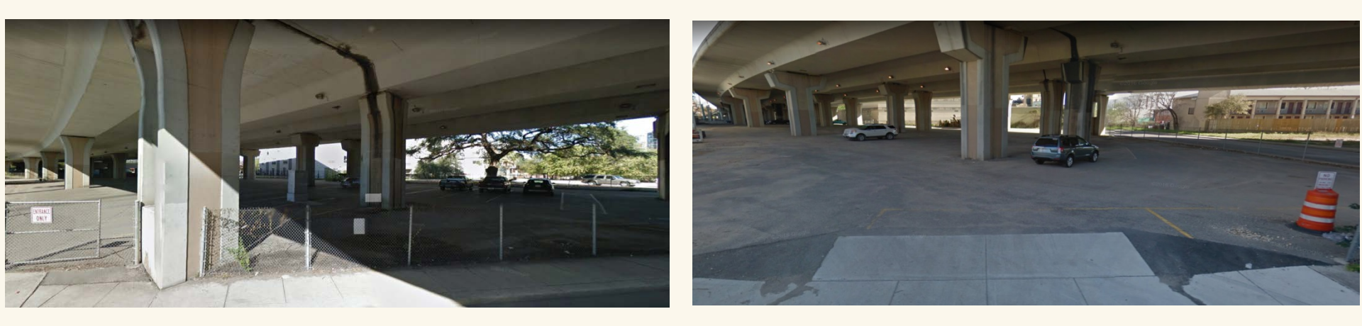
View from Camden Street