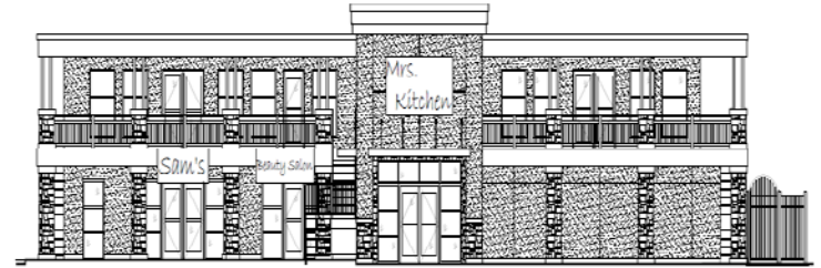
Sam's Barber Shop