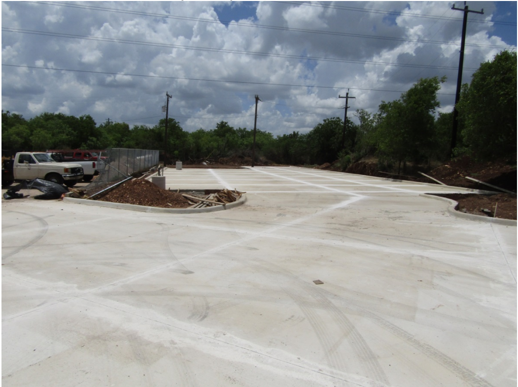
Bufferyard Request Along South Property Line (east)