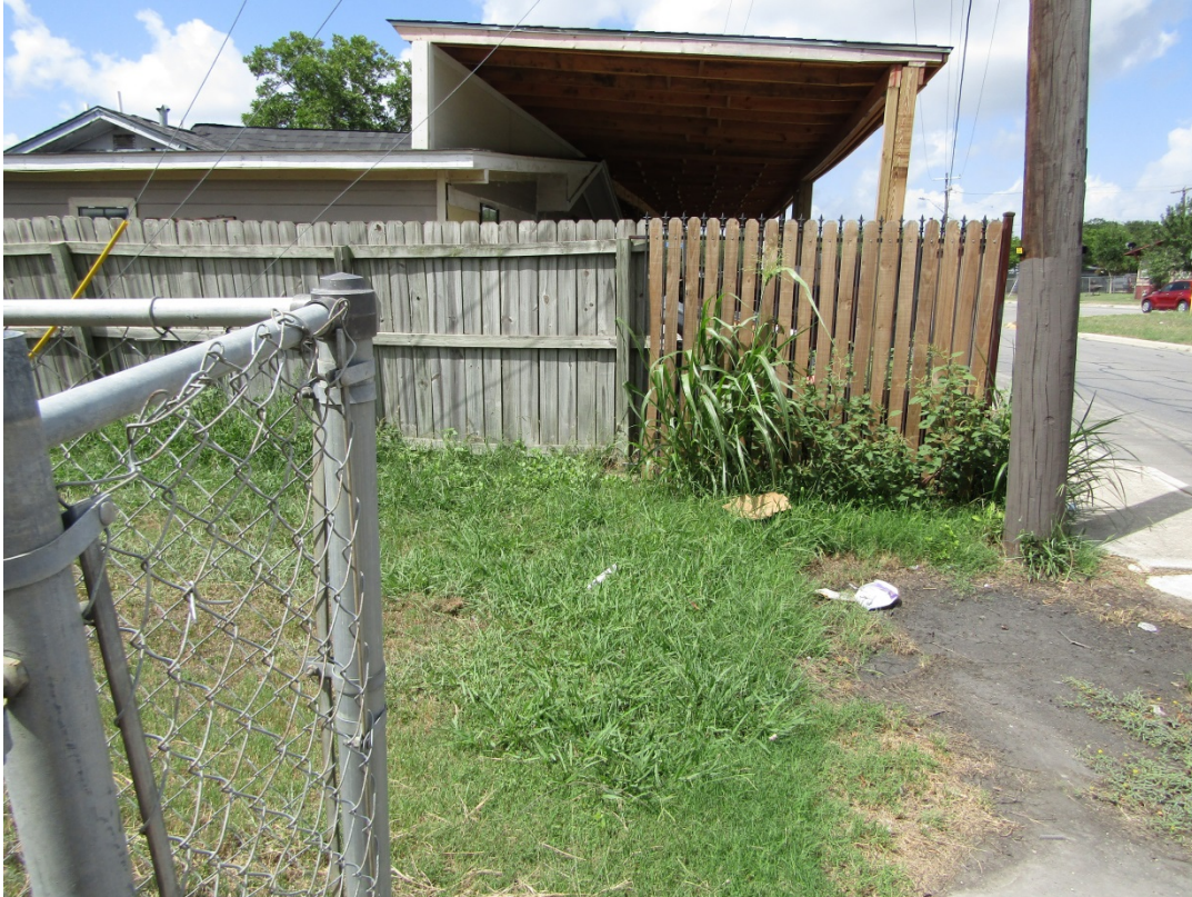
Neighboring property across subject property