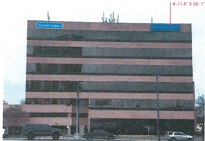
NORTH ELEVATION: (THORMAN PLACE) WALL SIGN