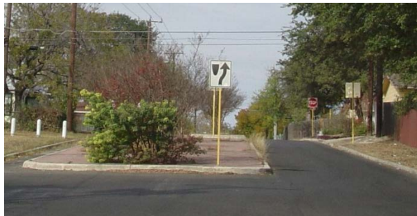
Half Street Closures