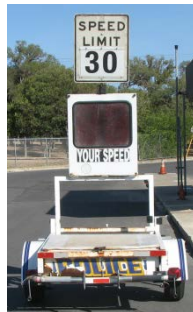
Temporary Radar Speed Trailers