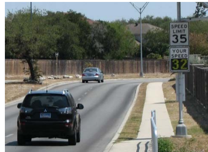
Speed Limit Radar Unit Signs