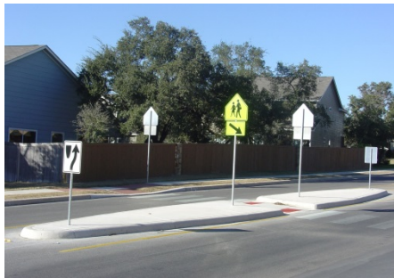
Raised Pedestrian Refuge Islands