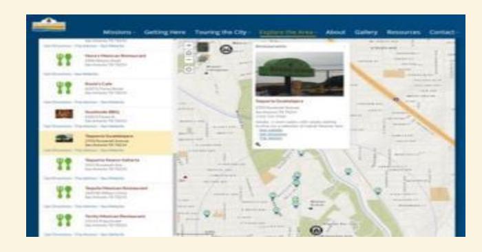
Mobile Responsive Website to connect visitors to local business