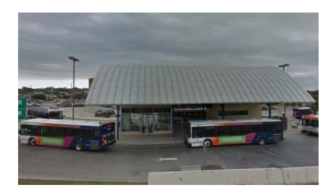
Randolph Transit Center